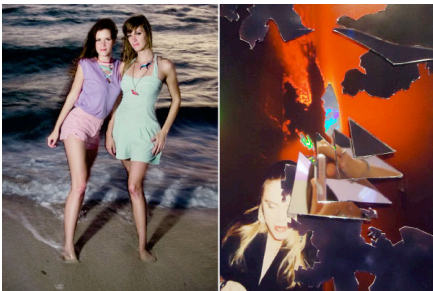
"Cruising Totem,"

Pepe can be seen at Discrepant Modernism at The Frost Art Museum until April 18.