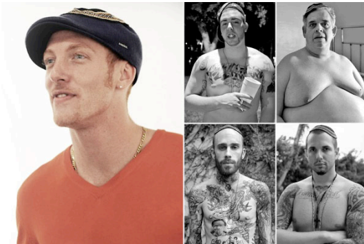
Photo: Courtesy of the artist; "Scaffold," Courtesy of the artist.

Tom can be seen in "Impermanence" at the Miami Beach Urban Studios Gallery until May 4.