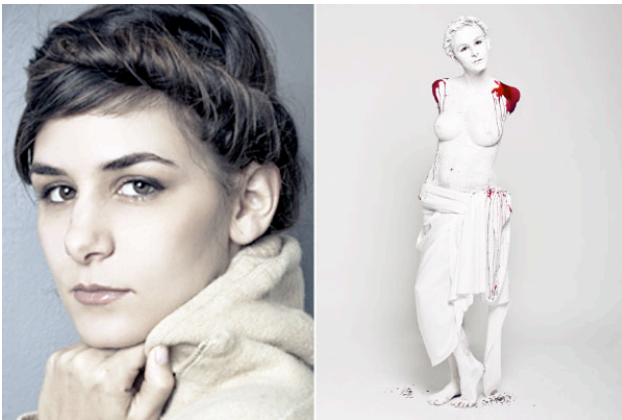
"134 days and 21 hours,"

Harumi can be seen at the Broward College South Campus gallery in March of 2013.