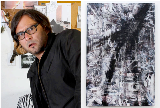
"Every Day is a Beautiful Day,"

Antonia can be seen at the Frieze Projects in New York from May 4 to 7.