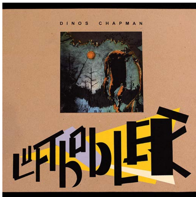
ABOVE The cover of Dinos Chapman's album Luftbobler . OPPOSITE TOP A concert of Pedro Reyes's musical instruments made out of firearms. OPPOSITE BOTTOM Martin Creed performing Work No. 1020 .

Mexican artist Pedro Reyes taps into the emotive force and broad appeal of music as a vehicle for social change. As part of his ongoing project "Disarm," Reyes has reshaped hundreds of firearms into otherworldly instruments, which still resemble weapons yet produce credible music, from metallic rock to hard-edge electronica.