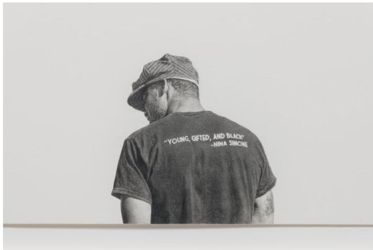
“Young, Gifted, and Black (May Day March, 2015, Los Angeles, California),” 2016. Credit Graphite on paper, 15” H x 22” W. Courtesy of the artist and Susanne Vielmetter Los Angeles Projects.