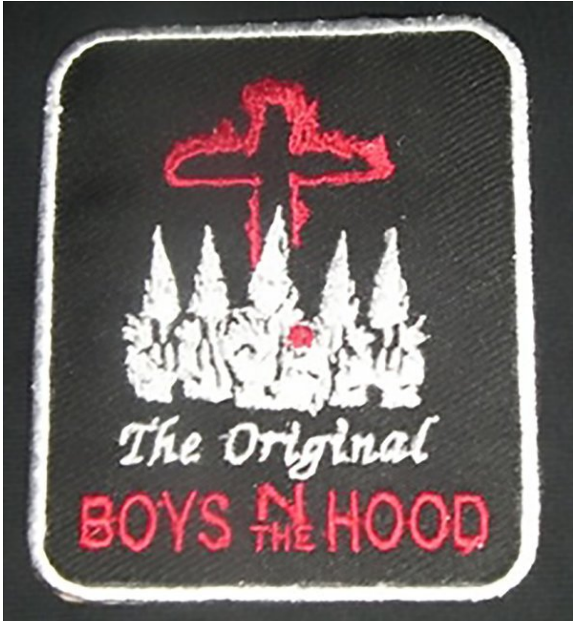
Photograph by Biggers; a patch in a vintage shop, Berlin, 2015. Credit Sanford Biggers