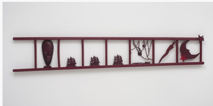
Betye Saar, "Red Ascension," 2011 Mixed media assemblage; 17 1/2 x 96 1/2 x 3 1/4 inches The artist and Roberts & Tilton, Culver City, California

Some of the more established artists show older and newer pieces. For example, Faith Ringgold, important as a figure in the Feminist movement of the 1960s, is represented here by the stunning "Black Light Painting #10: Flag for the Moon: Die Nigger" (1969). This painting of the American flag has the stars and stripes subtly altered to spell out the offending word. Riffing off misguided patriotism as well as Jasper Johns, it is riveting.