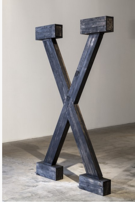
Brenna Youngblood, "X," 2012 Tree; 78 1/2 x 47 4/7 x 5 inches © Brenna Youngblood

Such well-known or established artists are mixed with younger and emerging talents. Shinique Smith's "Bale Variant No. 0023 (Totem)" (2014), made of colored fabrics massed into a column, has a singular presence while Brenna Youngblood's noble sculpture "X," (2012) made of "tree" — wood tinted in soft black patina— is quietly provocative, suggesting simultaneously Malcolm X and the conventions of modernism.