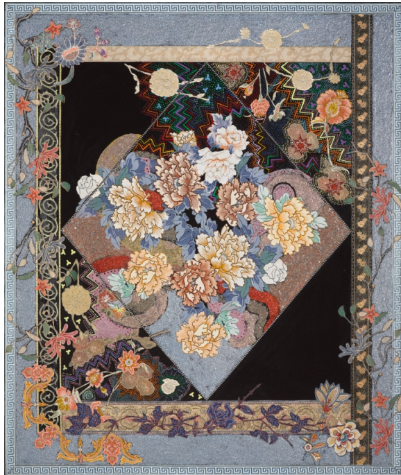
Miriam Schapiro, "Tapestry of Paradise" (1980) acrylic, fabric, glitter on canvas, 60 x 50"