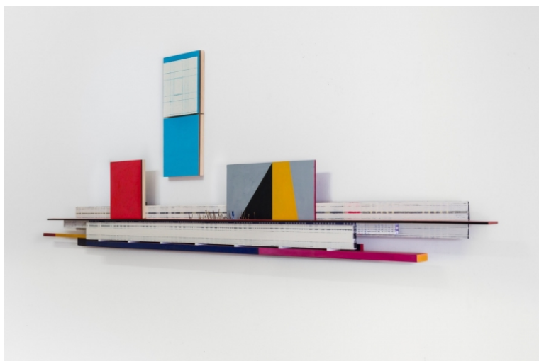
Remy Jungerman, “Horizontal Obeah Tjeke” (2016-18), cotton textile, kaolin, wood, nails, yarn, acrylic, (photo© Beatriz Meseguer, image courtesy of the artist)

The title of the work is a combination of different words that refers to the influence of the Atlantic Ocean in the sharing of geometry and patterns with the Americas and how these patterns got meaning in the African diaspora religion, especially Suriname. Obeah is a religious practice developed among enslaved West Africans. Tjeke is a dance style practiced by the Surinamese Maroons for honoring the ancestors.