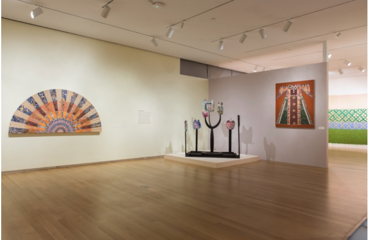
Installation view of Surface/Depth: The Decorative After Miriam Schapiro (left) Miriam Schapiro, “Orange Crush” (1979) acrylic and collage on canvas, 48 × 96 in. (121.9 × 243.8 cm); (center) Josh Blackwell, “Neveruses à Table (me and LP)” (2018) plastic, fiber, wood; (right) Miriam Schapiro, “Vestiture Series” 1978) Oil on canvas with collage, 60 1/4 × 50 in. (153 × 127 cm) (© 2018 Estate of Miriam Schapiro / Artists Rights Society (ARS), New York)

Re-emerging is a kind of women’s work authorized by the Feminist Art Movement: an expansive vision focused on pleasure, optimism, joy, and against violent imagery. These impulses are similar to those stimulating P&D, a style notable for just such qualities. A current exhibition at the Museum of Arts and