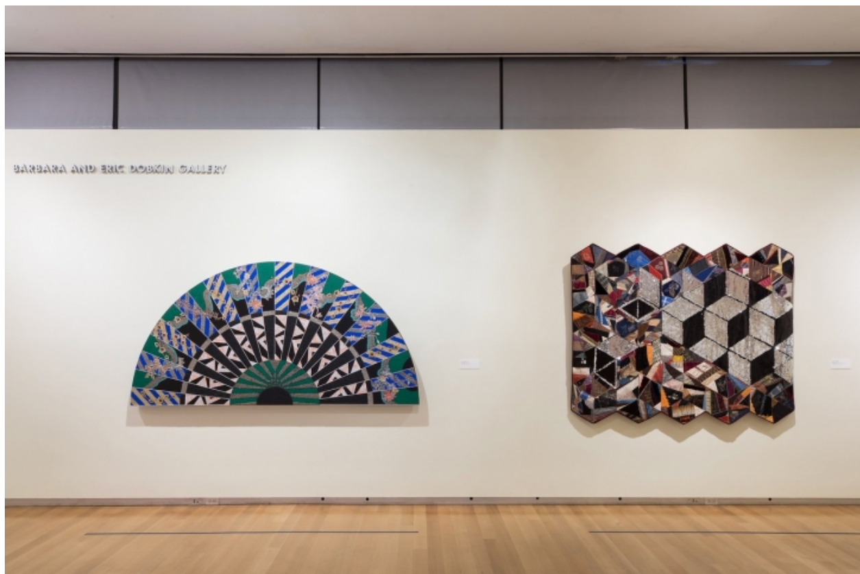
Installation view: (left) Miriam Schapiro, "Mexican Memory" (1981), acrylic, fabric and glitter on canvas, 48 × 96 in. (121.9 × 243.8 cm); (right) Sanford Biggers, "Ooo Oui" (2017) textiles, fabric, antique quilt fragment, sequins, 60 × 74 3/4 in. (152.4 × 189.9 cm)