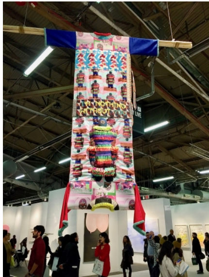
Jeffrey Gibson, (detail) “Without You I’m Nothing” (2018) as installed at the Armory Fair, polyester satin; neoprene; polyester; acrylic felt; canvas; acrylic paint; assorted glass, plastic, stone, and bone beads; brass grommets; acrylic yarn; batting; polyester laces and artificial sinew

expressing pleasure in visual complexity and beauty is infrequent. Cynics mask their prudishness, their unwillingness to probe pleasure, memory and play that occur in combination. Yet, we still desire to see beauty, and these exhibitions reveal a phenomenon of its populist engagement emerging. How and where P&D originated can help us understand why it is having a resurgence.