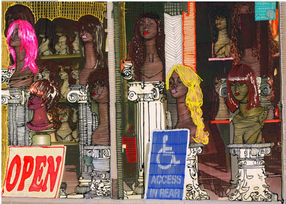
Detail of in-progress artwork design by Jaime Scholnick for Expo/Crenshaw Station, platform level (all images courtesy LA Metro)

One doesn't generally associate Los Angeles with public transportation, but in recent years the city has been upping its game. In preparation for the 2028 Olympic games, the Metro plans on radically expanding the railway