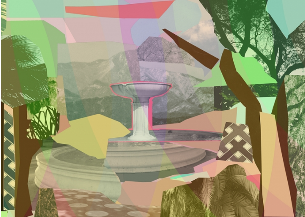
Detail of in-progress artwork design by Mickalene Thomas for Leimert Park Station, concourse level