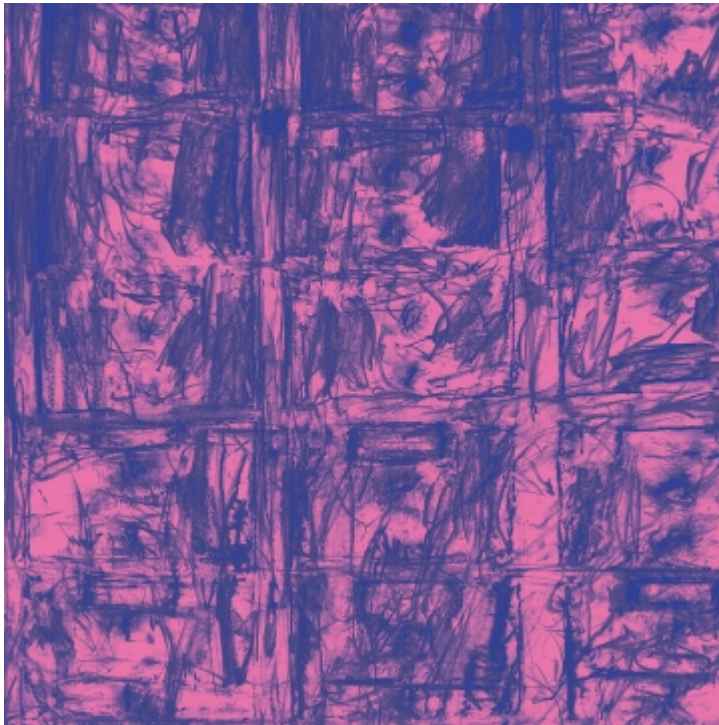
Detail of in-progress artwork design by Ingrid Calame for Leimert Park Station, street level

Many of the commissioned pieces draw on local histories.