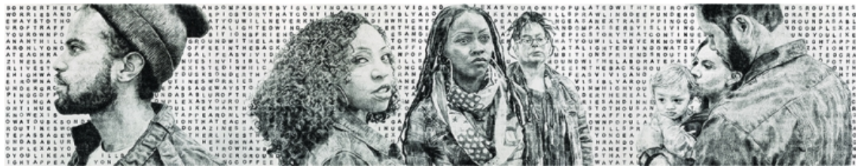
Detail of in-progress artwork design by Kenturah Davis for Downtown Inglewood Station