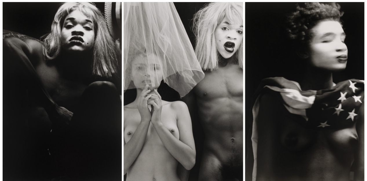
Lyle Ashton Harris, Americas , 1987–88, gelatin silver prints, triptych. ©LYLE ASHTON HARRIS/GUGGENHEIM MUSEUM, NEW YORK PURCHASED WITH FUNDS CONTRIBUTED BY THE PHOTOGRAPHY COMMITTEE