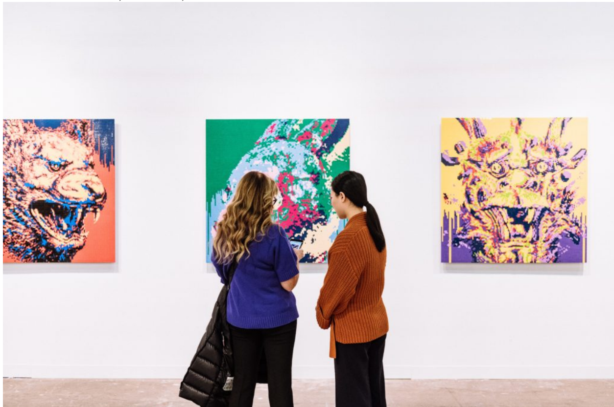
Ai Weiwei at Deitch Projects.

The art world has officially made it through another marathon fair gauntlet in New York. The booths are packed up, the crowds have dispersed, and we're left to sit back and take stock of what really went down at the Armory Show's 25th anniversary edition, which managed to sail through the weekend crisis-free after a rocky start .