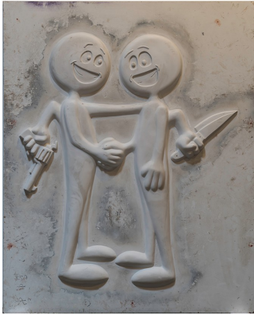
Kai, The Pleasure Is All Mine .

animal resembling a walrus out of sustainably sourced beetle wings, waterbucks horn, pheasant feathers, porcupine quills, foam, wood, and glass. Visitors can expect to see other invented or suggested animal pieces in diverse media at Steinbaum's booth. Tuesday, December 4, through Sunday, December 9, at 1 Miami Herald Plaza at NE 14th Street, Miami; 800-376-5850; artmiami.com . Tickets cost $35 to $275.