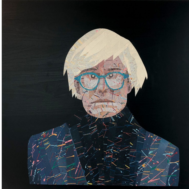
Carmine Bilardello, Warhol . Courtesy of MID4ART

ephemeral and ineffable. In Georgia Sagri's photo series Diana Speaks With Animals , a nude woman wanders in front of the barred window of a house with an overgrown yard. Myrlande Constant's colorful, feminist voodoo flags use a beading technique seen in wedding dresses or haute couture. Thursday, December 6, through Sunday, December 9, at 1400 N. Miami Ave., Miami; 305-347-7400; newartdealers.org . Tickets cost $10 to $40.