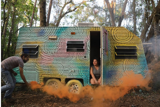
Milagros Collective.

acrylic, and oil paint that suggests a floral or corporeal shape. Contemporary Art Projects, located on Biscayne Boulevard, will show a large-scale photo of an aged bottle of Chanel No. 5 by the Dutch artist Anouk. Wednesday, December 5, through Sunday, December 9, at Mana Wynwood, 2217 NW Fifth Ave., Miami; reddotmiami.com ; spectrum-miami.com . Tickets cost $10 to $85 and are free to kids 15 and under.