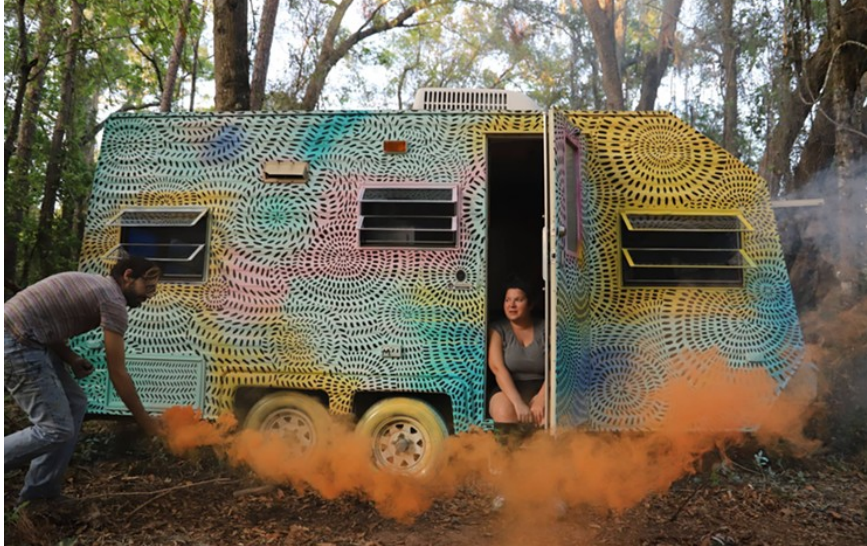
Milagros Collective.