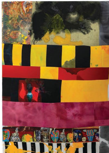
Pepe Mar's "Checkerboard," 2018; acrylic on printed fabric, 84 x 60 inches; photography by Zach Balberl; courtesy David Castillo Gallery