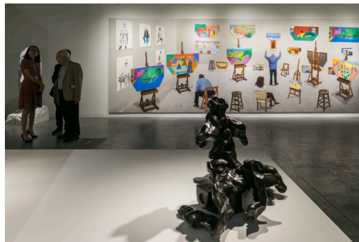
Richard Gray Gallery at Art Basel in Miami Beach.