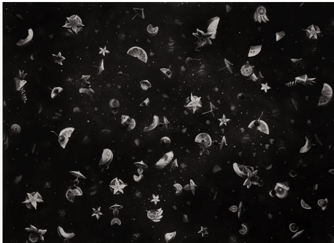
The Happy Hour (Gonzalo Fuenmayor, 2018)