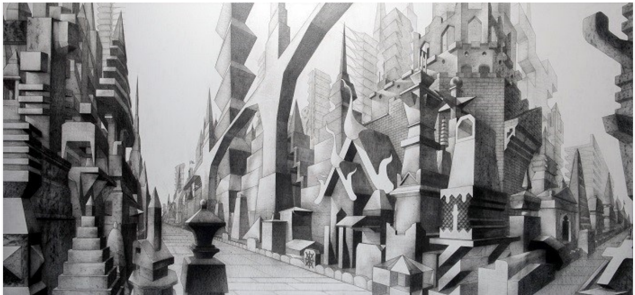
Wat (Glexis Novoa, 2013)

Deconstruction: A Reordering of Life, Politics and Art features more than 20 works including acrylic on canvas, digital C- prints, found objects, photography, mixed media, engraving and installations.