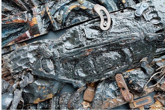
Cross-Cultural Trap, detail (Christopher Carter, 2018)