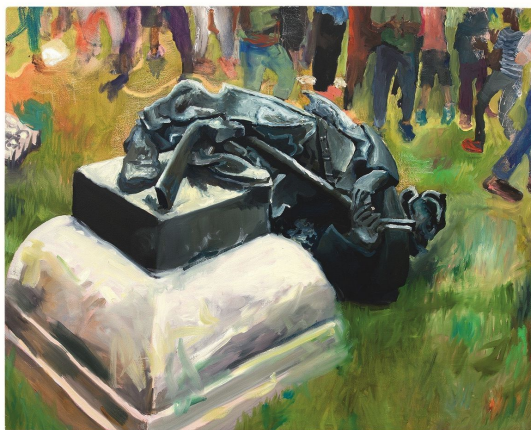
Celeste Dupuy-Spencer, "Durham, August 14, 2017," 2017. Oil on canvas (UCLA Hammer Museum)

A charming grunge imbues Celeste Dupuy-Spencer's clotted pictures — a toppled Confederate statue crumpled like a corpse; a crude man anxiously reading a love letter; smokers indulging their simple, deadly pleasure while idling in a car parked in a trash-filled alley; and, a tightly clustered crowd drowning in a turbulent sea, unable to grasp a nearby lifeline, its arabesque almost decoratively baroque. The quirky paintings, touchingly civilized, are a gentle but firm avowal of humanity during extraordinarily trying times.