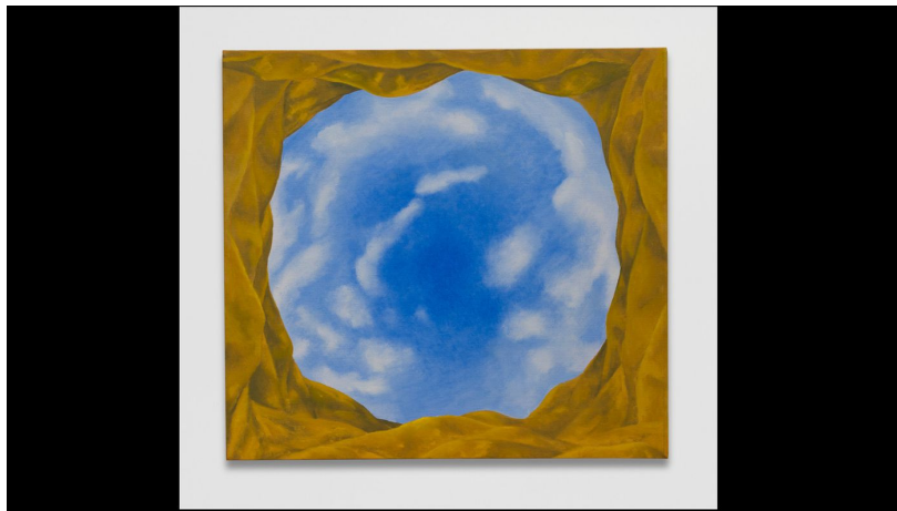
Luchita Hurtado, "Untitled," circa 1976, oil on canvas (UCLA Hammer Museum)