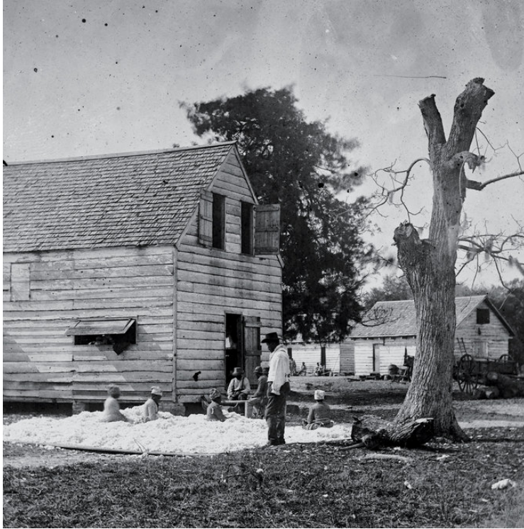
African-Americans preparing cotton for the gin at a plantation on Port Royal Island, S.C., in the 1860s.