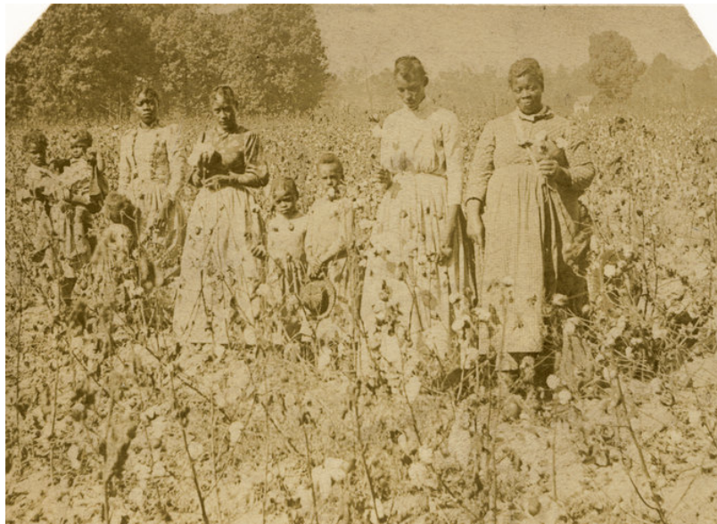
Women and children in a cotton field in the 1860s.

poverty, lawfulness and cruelty, democracy and totalitarianism, America chose all of the above.