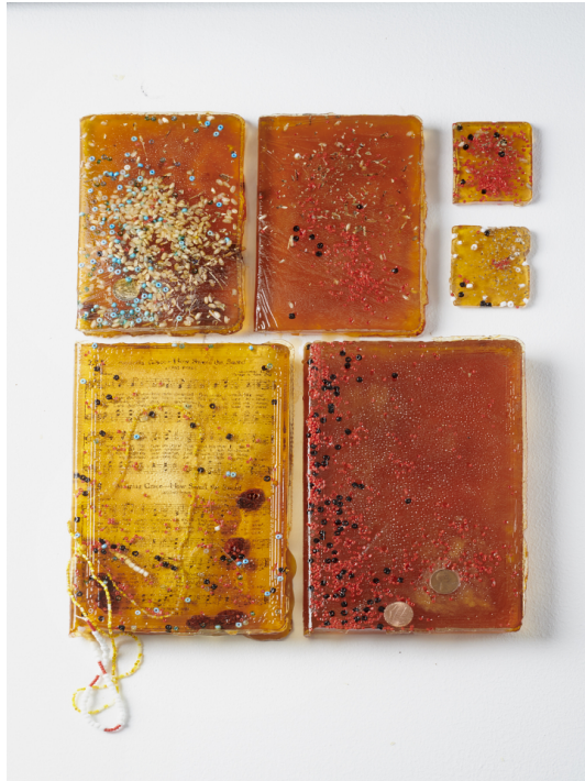
Andrea Chung, “Proverbs 12:22” (2019), Sugar, beads, rice, herbs, spices, and paper, Site-Specific Installation

contextualizations of these objects and their existence within and between cultures. “Embajador,” notably, translates to “ambassador.”