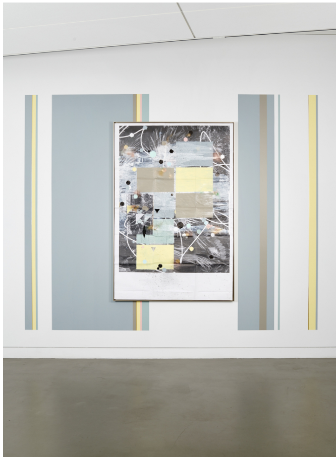
Adler Guerrier, “Untitled (Place marked with an impulse, found to be held within the fold) iv” (2019), Ink, graphite, collage, acrylic, enamel paint and xerography on paper

many wealthy Cubans dispossessed by the 1959 communist revolution, the Fanjul family relocated to Florida.