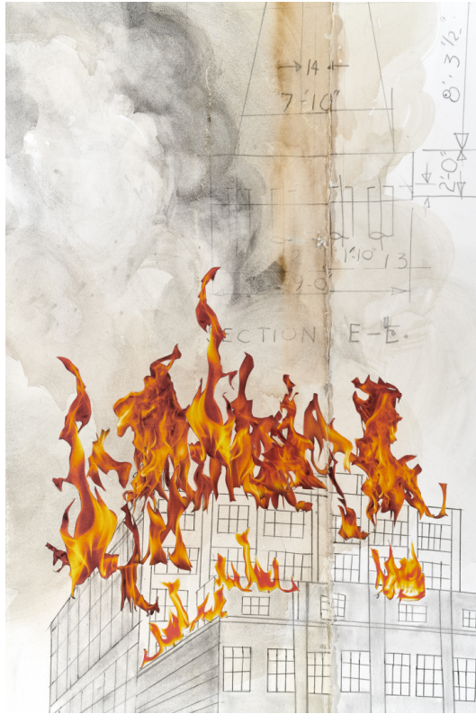
Firelei Báez, “Love that does not choose you (Collapse the rooms and structures that depend on you to hold them)” (2018) (detail), Gouache on paper

Also in the consideration of space is Firelei Báez’s illustration of the architectural plan for the Domino Sugar Refinery in Brooklyn, which bears a striking resemblance to the famous Brookes slave ship plan . Her illustration of the 1882 fire recalls the plant’s near-destruction as both historical record and anti-colonial catharsis. The Brooklyn refinery was the original refinery of the American Sugar Refinery Company, which had sugar and lumber investments in Cuba, Puerto Rico, and other parts of the Caribbean. And in true neocolonial fashion, Domino Sugar Corporation was sold to Florida Crystals Corporation in 2001. Florida Crystals is a part of FLO-SUN, a sugar conglomerate run by the Fanjul brothers, owners of Fanjul Corp., a sugar dynasty whose familial origins trace back to cane sugar mills, refineries, and distilleries in 19th century Cuba. Like