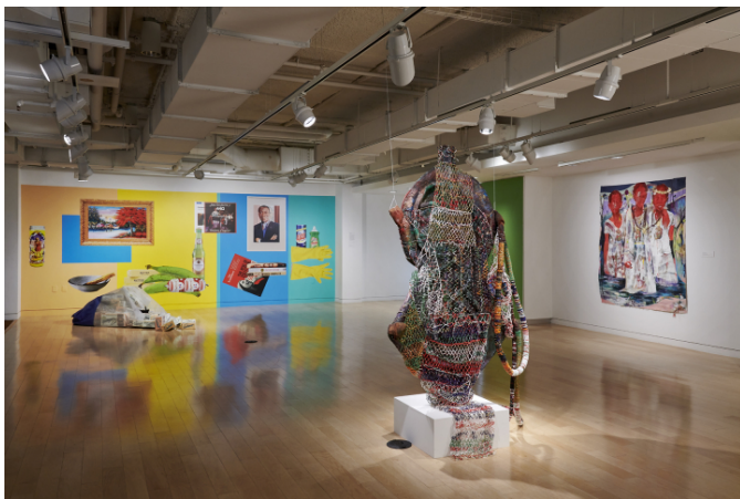
Installation view of Coffee, Rhum, Sugar & Gold: A Postcolonial Paradox at the Museum of the African Diaspora Lavar Munroe, “Church in the Wild” (2019), Mixed media on canvas (Courtesy of the Artist and Jenkins Johnson Gallery, San Francisco and New York)