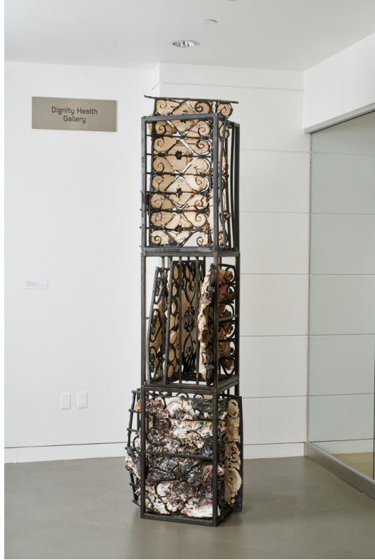
Angel Otero, ““Slots’ Sl#1 (SCA03)” (2013), Fired Steel and glazed porcelain (Courtesy the artist and Lehmann Maupin, New York, Hong Kong, and Seoul)

In the final consideration of space are Angel Otero’s veranda pieces, sculptural forms of steel and glazed porcelain. Verandas, of course, are both functionally decorative and protective architectural pieces, but in the botching of the Hurricane Maria disaster relief and in the midst of #RickyRenuncia protests on the island within a historical context of the American colonization of Puerto Rico, they can also represent a carceral containment.