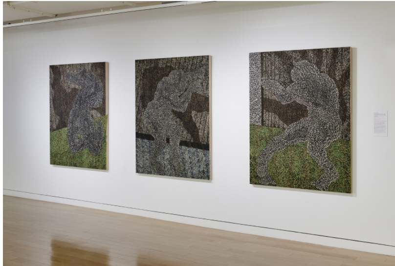
Didier William, “Lonbraj mwen se kouwon mwen 1 – 3” (2019), Collage, acrylic, and wood carving on panel (Courtesy of the artist)

militarism and hanging Black bodies alongside depictions of white leisure. It is a “present[ation] of the audience to themselves,” per the wall text hanging beside “Pimper’s paradise, the Terra Nova nights edition” (2018). It seems to visually articulate the adage that the revolution will inevitably eat its children, or here, the pessimistic reality that post-colonial leaders will swear an oath of fealty to power and capitalistic excess before their people’s wellbeing.