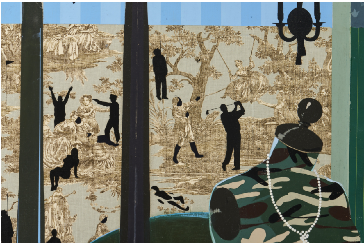
Phillip Thomas, "Pimper's paradise, the Terra Nova nights edition" (2018) (detail), Mixed media on canvas

Phillip Thomas's own evocation of grandiose Old Mastery (particularly, and fittingly, from France) seems to juxtapose a seemingly white-aspiring post-colonial Black bourgeoisie against a literal wallpapered backdrop of Black suffering, with silhouetted detailings of white