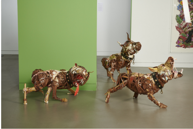
Lavar Munroe, “And the Dogs Went Silent: Gun Dog 1 – 3” (2017), Cardboard, deconstructed junkanoo costumes, found toys, found marbles, rubber gloves, PVC pipe, found shoes, string, spray foam, spray paint, wood, lollipop, feathers, latex house paint, and polyester resin (Courtesy of the artist and Jenkins Johnson Gallery, San Francisco and New York)