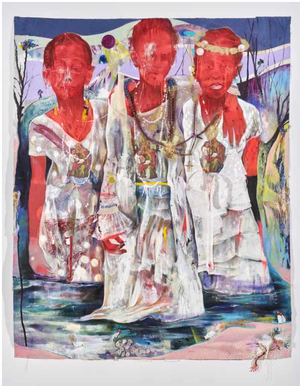
Adjacent to Benzant’s sculpture is Lavar Munroe’s “Church in the Wild” (2019), a beautiful and eerie graffiti-like portrayal of three saintly Black girls enrobed in religious symbols and who seem to be emerging from a swamp. In addition to producing autobiographical work, Munroe describes also being informed by “critical investigation and theories surrounding mythology and literature,” made evident by the triadic Gun Dogs (2017) sculpture series that evokes the hellhound Cerberus; the hellmouth here, though, is the plantation space.