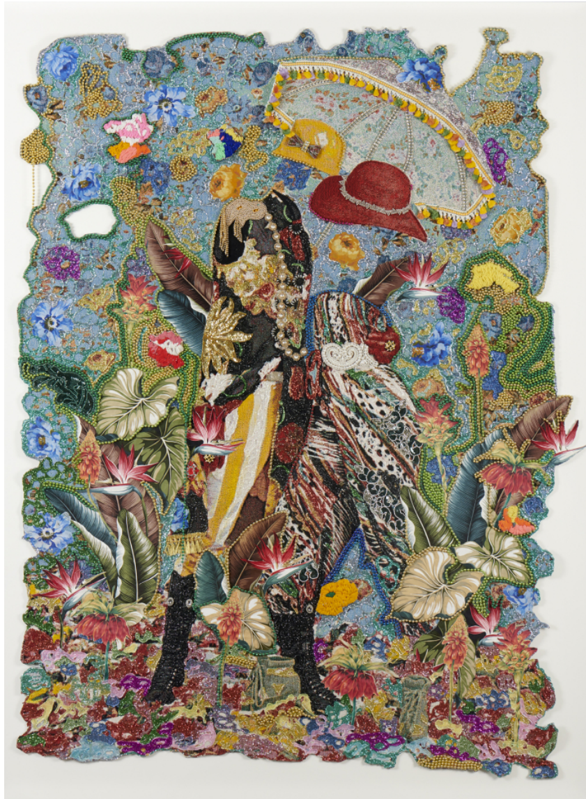
Ebony G. Patterson, “A View In” (2015), Mixed media jacquard woven tapestry with hand-cut elements

primacy as cash crops of European coloniality. A further paradox lies in the fact that many of the Caribbean nation-states that have emerged from these former plantation economies presently exist as raw exporters of fruits, extracted mining products, natural gases, and fertilizers, and are also consumer markets for the finished manufactured and agricultural products sold back to them through trade agreements and manipulated global markets. These resource-rich states, to varying degrees, are trapped in political and economic relationships with their former colonizers in order to participate in the international financial marketplace; it is within this context that Dexter Wimberly and Larry Ossei-Mensah curate this show, put on at the Museum of the African Diaspora.