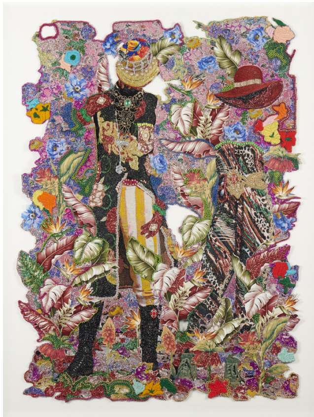
Ebony G. Patterson, “A View Out” (2015), Mixed media jacquard woven tapestry with hand-cut elements

The work contained within this show reminds us of the nonlinearity of colonial time: it debunks the liberal mythology of time’s equation with social progress and illustrates a present still steeped in a colonial past.