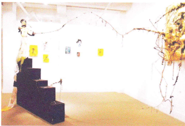
“Meet Me at the Underground”