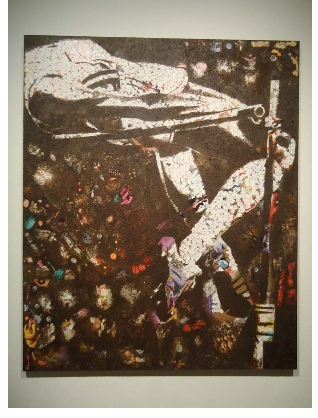
Peña, collage, eggshells, crushed flies on canvas

list either "crushed flies" as a primary material or "cockroach wing fragments." One beautiful collage also incorporates smashed eggshells.