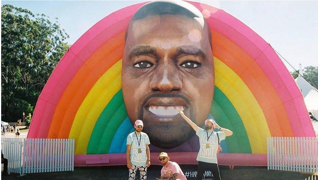
Happy Kanye by Hungry Castle