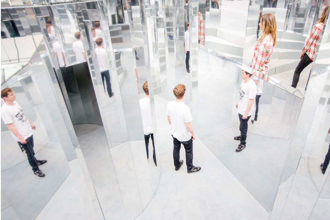
Room 2022 by Es Devlin