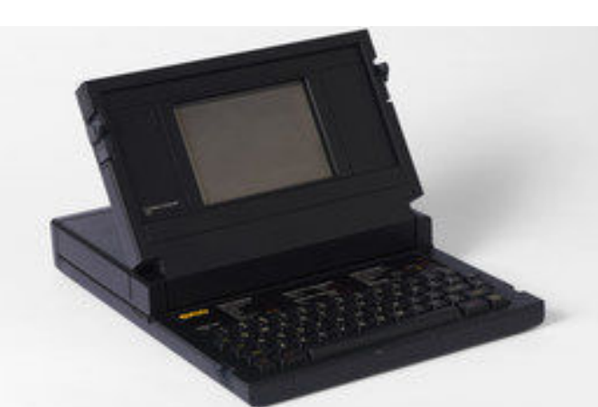
How the Cooper-Hewitt Fosters the Future of Design and Its Decorated Past, Under One Roof