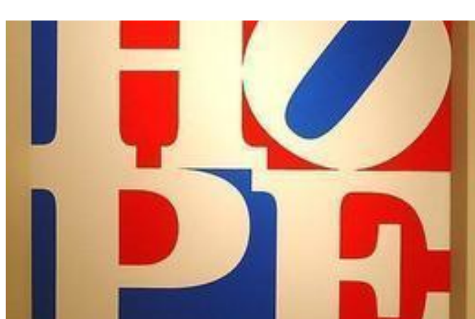
Beyond 'LOVE' and 'HOPE': Symbolic Screenprints by Robert Indiana