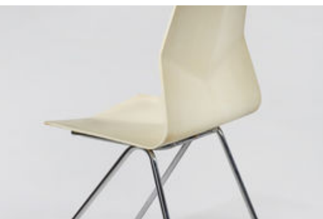
Rare Design from René-Jean Caillette, Postwar Master of Clean Lines and Modern Materials