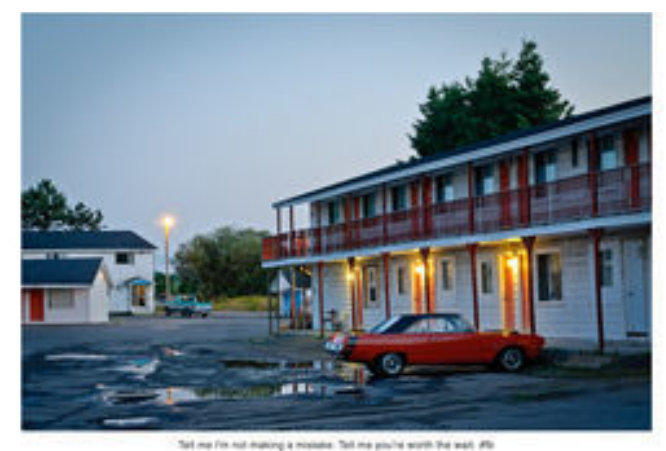
Twitter Geolocation Inspires a Poignant Photography Series