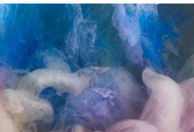
Wet Your Palette: A Group Show of Water's Numerous States