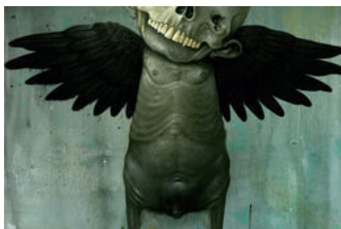
Gothic Sensibilities and Romantic Melodrama at Brumfield's Gallery