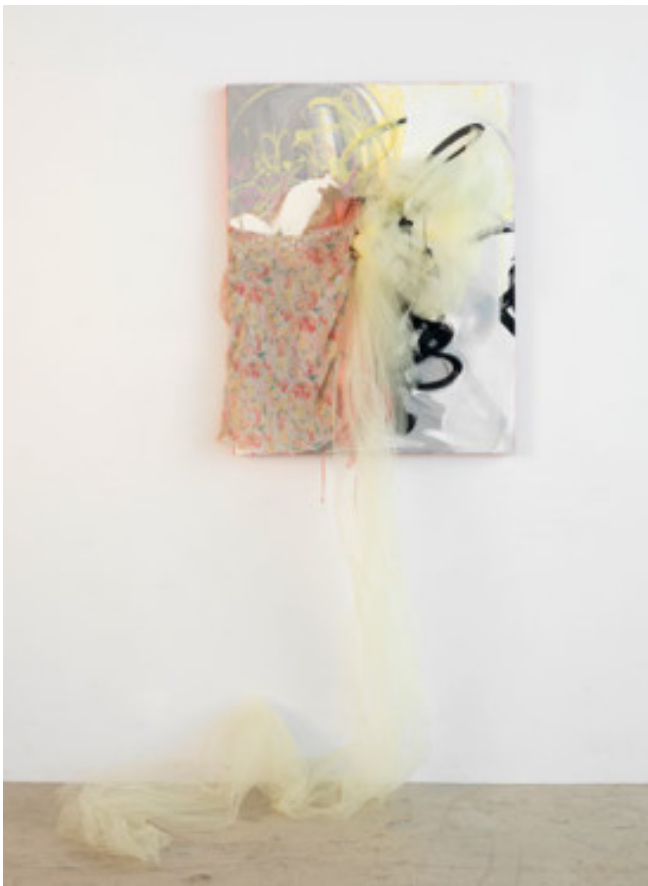
Shinique Smith, There Were Sunday Mornings , 2008. Acrylic, fabric, collage with train on canvas, 40 x 30 x 72 inches.

totality now becomes half-painting, half-sculpture. An example of the third way, There were Sunday Mornings (2008) has a train of fabric, so identified in the material list, which establishes itself as a separate object, leaving the surface to fall to the floor. It is politely evocative and carefully poetic. Bright Matter (2013) clearly establishes its own world, the fabric almost working free from the image, but not quite. Here in Smith's second mode, the fabric becomes another dimension in the work, but one that is not fully sculptural. It reasserts the movement and color of the flat surface continuing its mood and activity into bundles of color and light that activate its own separate abstract imaginary world. And in the most unifying presentation of fabric and paint, Through Native Streets (2011) and Seven Moons (2013) incorporate the fabric patterns and colors more fully into one abstract image. While they still have their own voice, one differentiated from the paint and ink, they are speaking in the same space and at the same time. In the case of Through Native Streets (2011), the dramatic tensions and narrative contrasts have multiple layers, patterned and emotional contrasts, and a tightly orchestrated and focused range of colors. I admire the eloquence and visual power of both of these works, while yet being aware of their different types of drama.