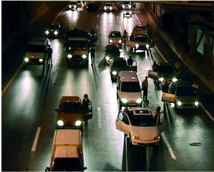
Yael Bartana, Trembling Time, 2001.