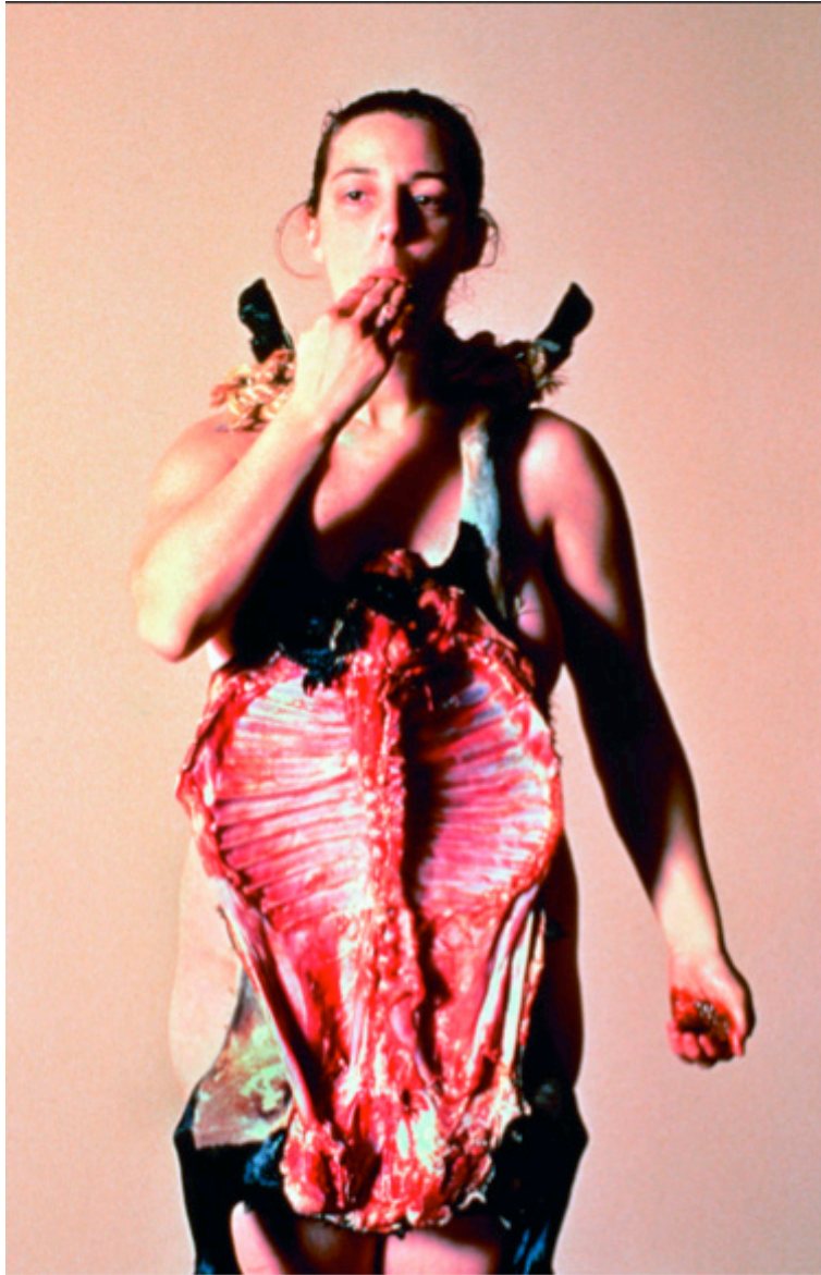
Tania Bruguera, The Burden of Guilt , 1997–99.