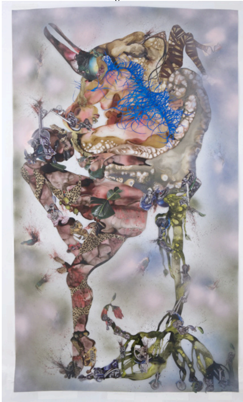
Wangechi Mutu, This you call civilization? , 2008. Courtesy of the artist and Susanne Vielmetter Los Angeles Projects.