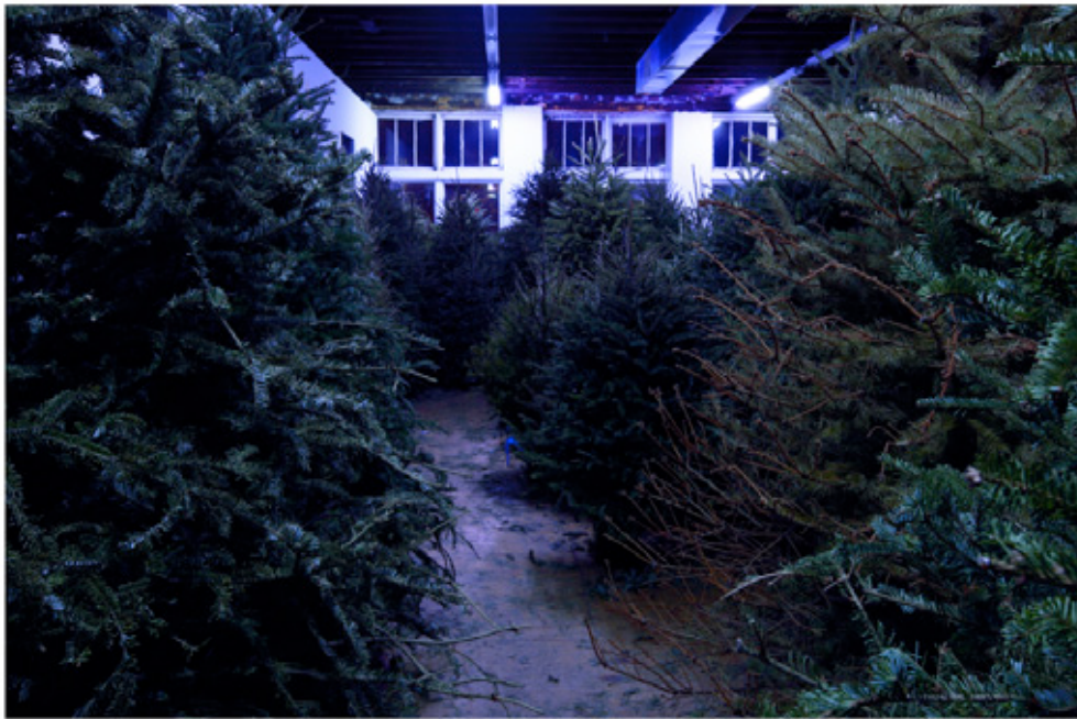
Klara Liden, S.A.D. , 2012.