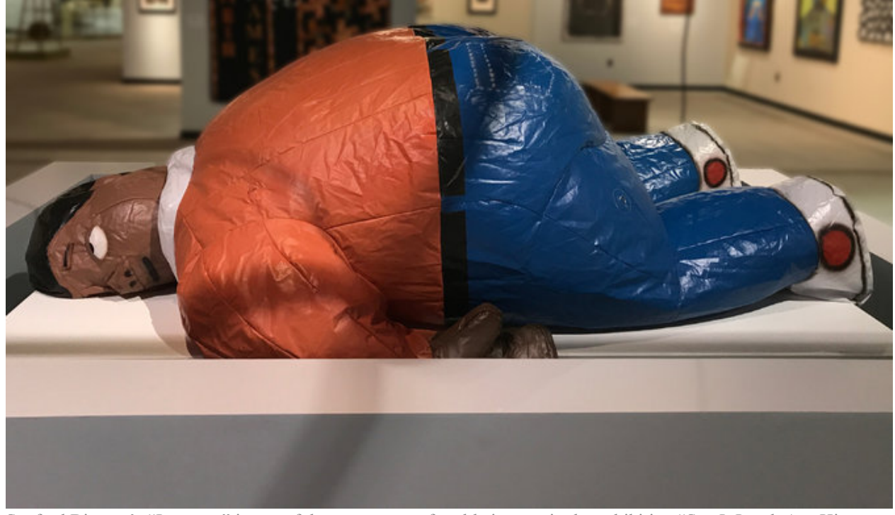
Sanford Biggers's "Laocoön" is one of the more uncomfortable images in the exhibition "Say It Loud: Art, History, Rebellion," at the Wright Museum of African American History.

One of the most uncomfortable works at the Wright is Sanford Biggers's 2015 "Laocoön." The cartoonish, bulbous black male is made from inflatable vinyl and is clothed in a bright orange shirt and bluejeans. He resembles a sleeping Fat Albert, but the museum placard suggests that the work depicts Eric Garner, the black man who died in 2014 after being restrained with a chokehold by the New York City police.