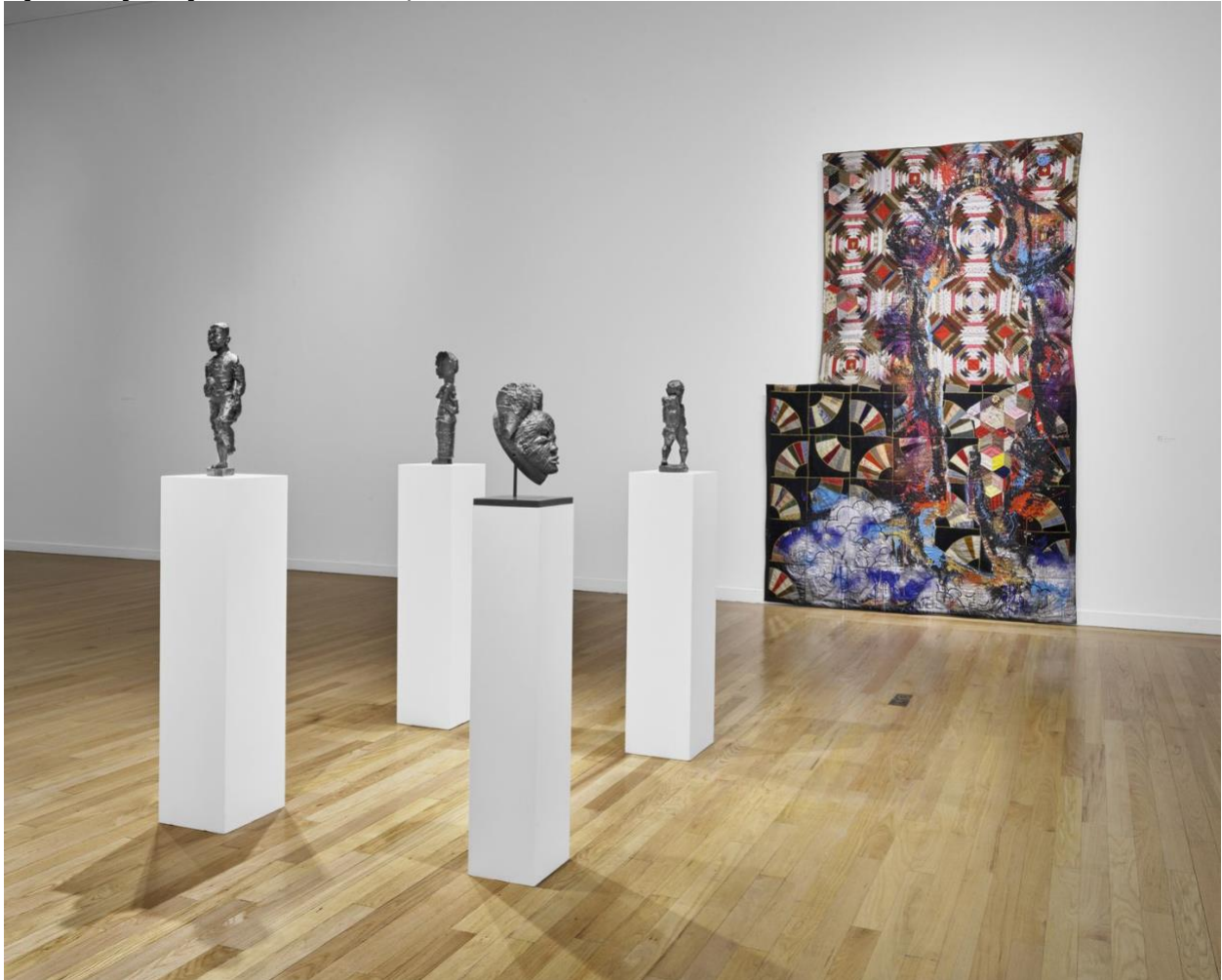
Sanford Biggers's "BAM" series honors African-American victims of police violence. TUFTS UNIVERSITY ART GALLERIES

By Murray Whyte Globe Staff, Updated November 7, 2019