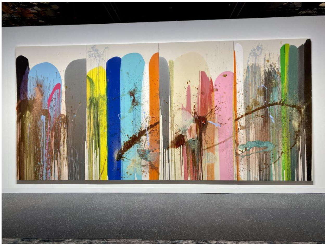
John M Armleder, Stetson (2019), from Almine Rech, New York, at Art Basel Miami Beach Meridians.