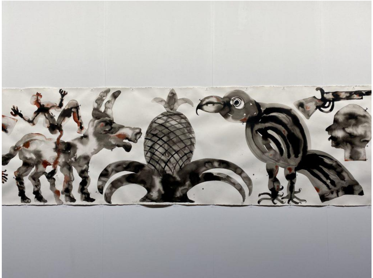
Work at Art Basel Miami Beach Meridians.