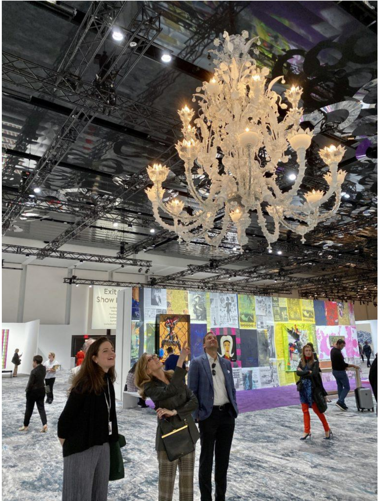
Work by Fred Wilson and Pepe Mar at Art Basel Miami Beach Meridians.