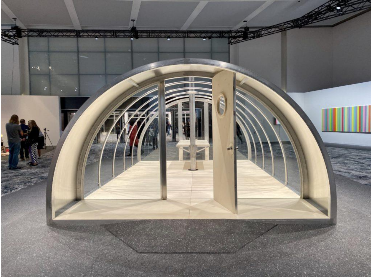
Oscar Tuazon, Quonset Tent (2016), from Chantal Crousel, Paris, at Art Basel Miami Beach Meridians.

Sculptural works abound as well, such as Oscar Tuazon's Quonset Tent (2016) from Chantal Crousel, Paris. The architectural work was inspired by the efficient prefabricated Quonset huts made from corrugated galvanized steel and used for various purposes including temporary housing and military encampments. And Los Angeles's Anat Ebgi is restaging Tina Girouard's Pinwheel (1977), a performance only seen at the New Orleans Museum of Art. Each of the work's four performers uses the objects in their quadrant of their installation to enact a ritual.