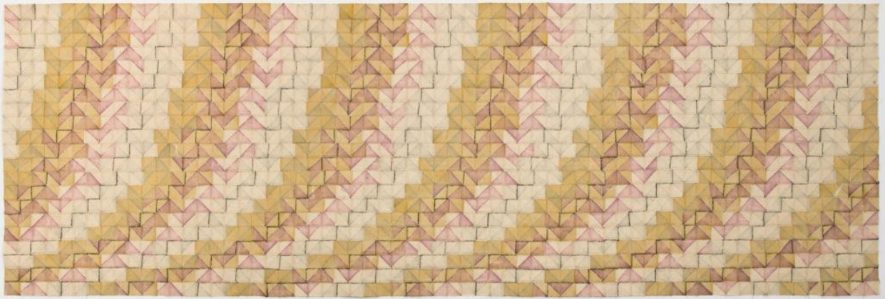
Allan McCollum, Constructed Paintings (1971–73), from Petzel, New York, at Art Basel Miami Beach Meridians.