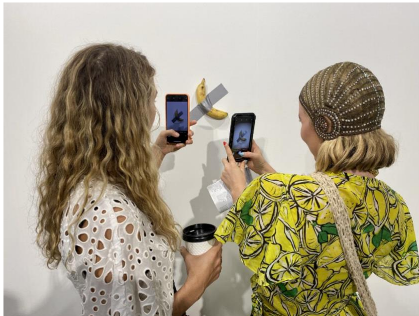
Fairgoers take pictures of Maurizio Cattelan's Comedian , for sale from Perrotin at Art Basel Miami Beach.

$3.8 million: Georg Baselitz, Sing Sang Zero (2011) at Thaddaeus Ropac $2.4 million: David Hammons's mixed media work, Untitled (Silver Tapestry) (2008), at Hauser & Wirth