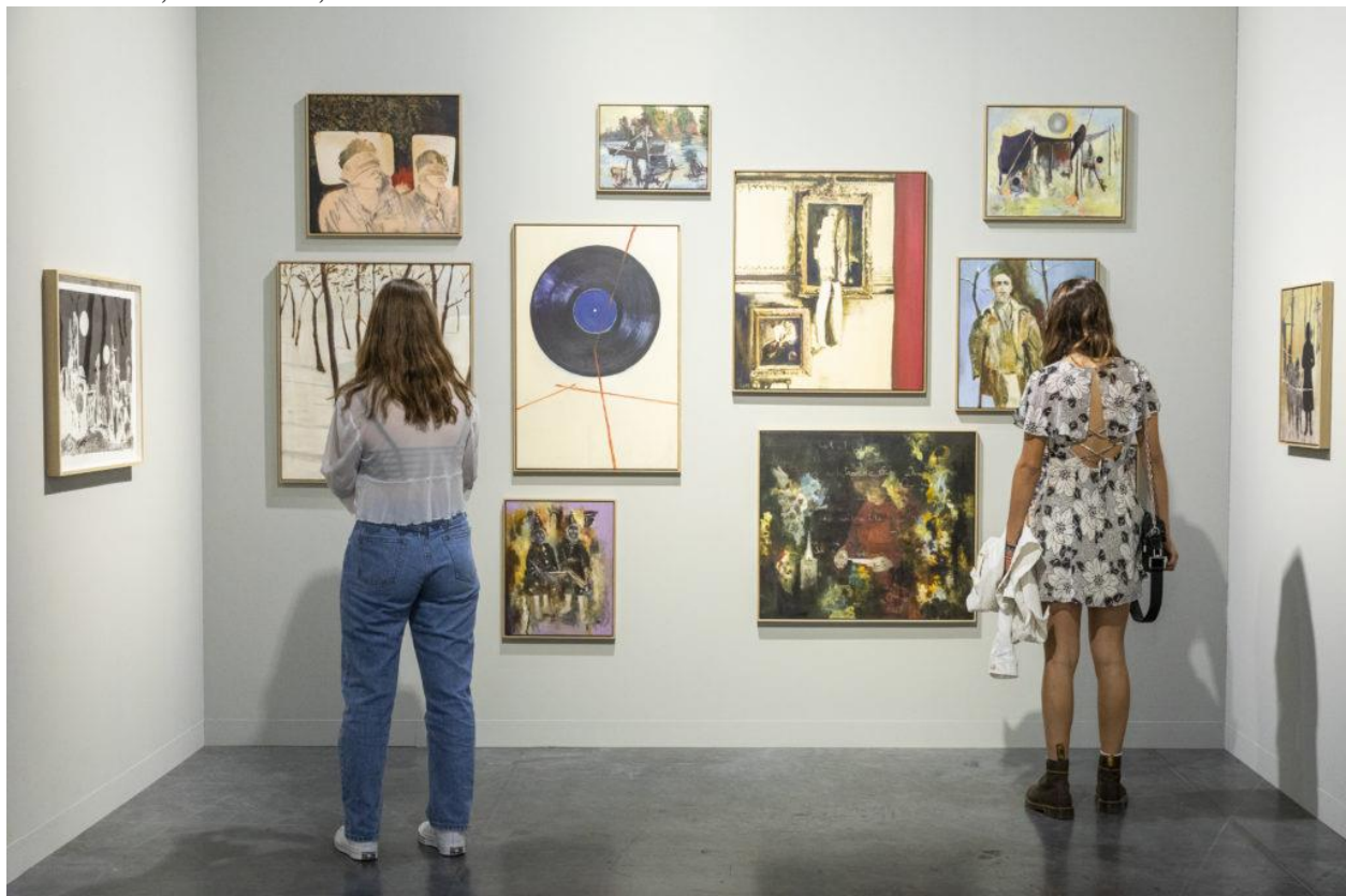
Installation view of Galerie Peter Kilchmann at Art Basel in Miami Beach.

Art Basel in Miami Beach was... bananas. The story of the week, for better or worse, was Maurizio Cattelan's Comedian , the banana duck-taped to the wall that sold for $120,000 (twice) and eventually became so popular it had to be prematurely removed .