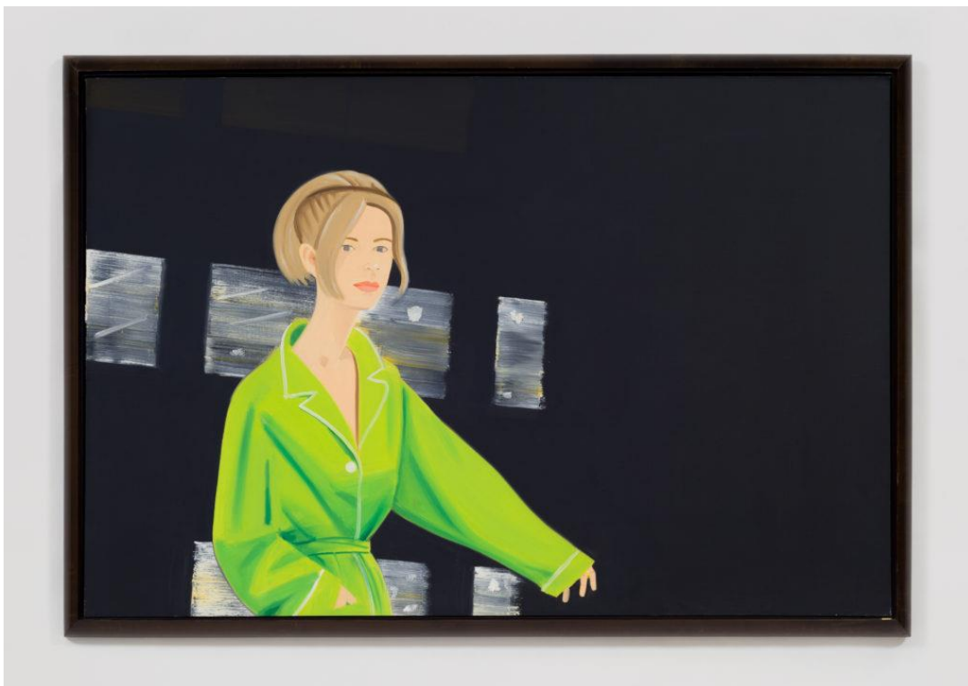
Alex Katz, Yvonne in Green (1995) at Marlborough.

Over $2 million: A painting by Marc Chagall at Hammer Galleries