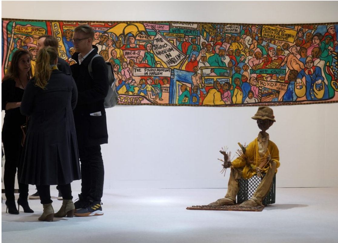
Visitors at The Armory Show 2020 at Pier 90 and 94.

After surviving last year's late-breaking drama surrounding a structurally unsound pier, the Armory Show was undoubtedly expecting 2020 to be less eventful (and turbulent) than 2019. This was, of course, not the case. The very real threat of COVID-19 led New York's governor, Andrew Cuomo, to declare a state of emergency on the final day of the art fair.