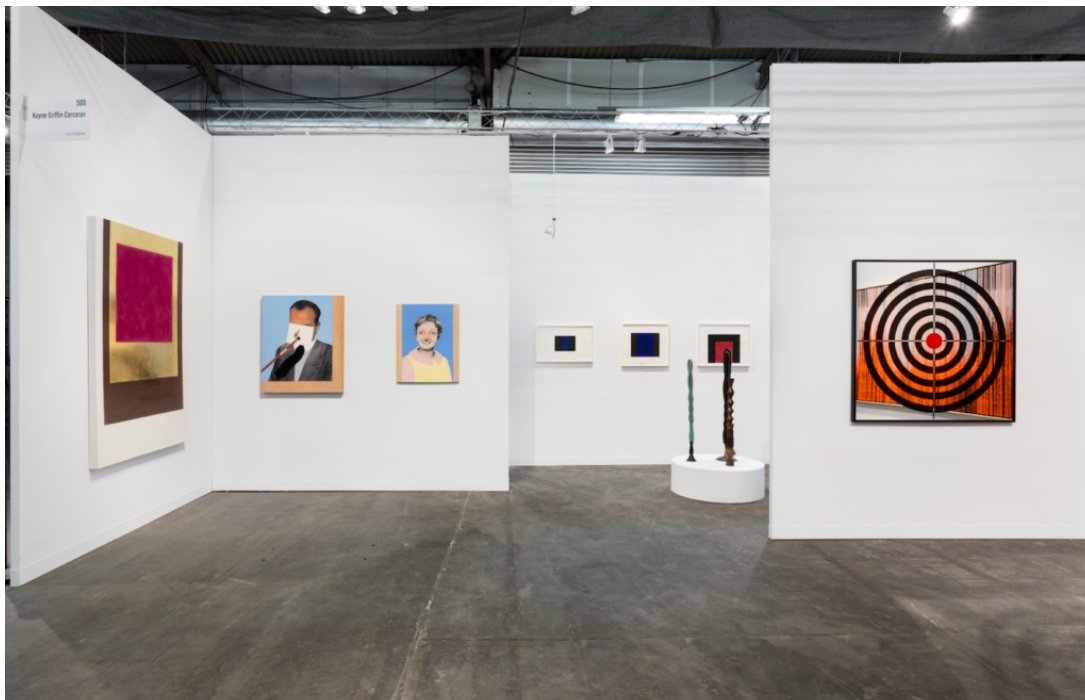
Installation view of Kayne Griffin Corcoran at The Armory Show, March 4 – 8, 2020.

$280,000: Mary Corse, Untitled (White Narrow Inner Band with White Sides, Beveled) (2020) at Kayne Griffin Corcoran