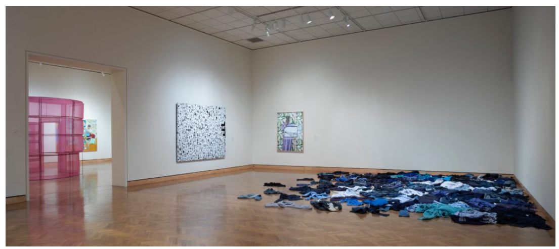
Installation views of the exhibition "When Home Won't Let You Stay: Art and Migration."