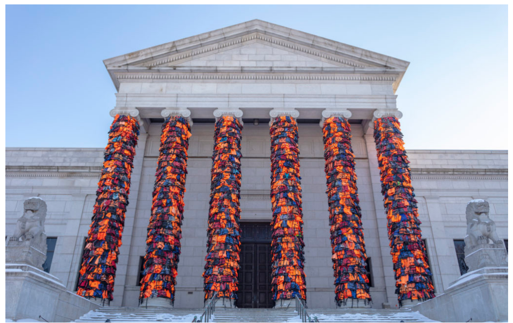
Ai Weiwei's "Safe Passage", installed at Minneapolis Institute of Art for the exhibition "When Home Won't Let You Stay: Art and Migration".

While museums around the globe are closed to the public, we are spotlighting each day an inspiring exhibition that was previously on view. Even if you can't see it in person, allow us to give you a virtual look.