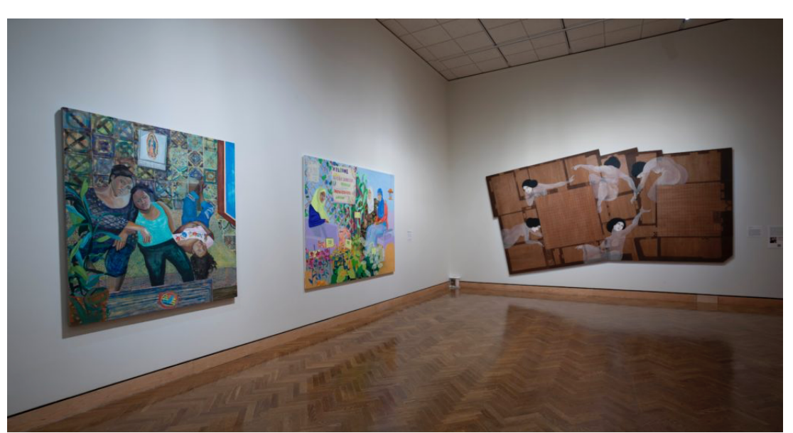
Installation views of the exhibition "When Home Won't Let You Stay: Art and Migration."