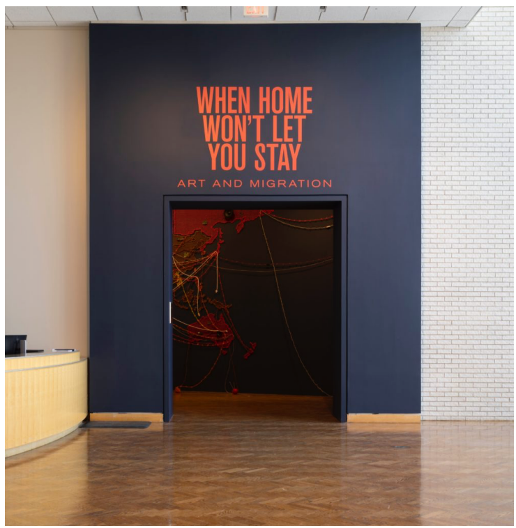
Installation views of the exhibition "When Home Won't Let You Stay: Art and Migration."