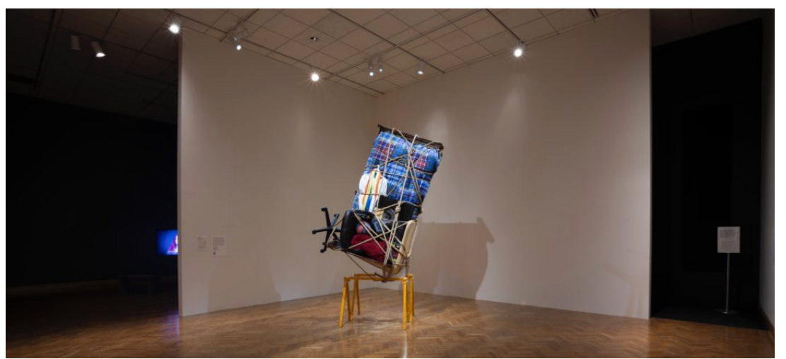
Installation views of the exhibition "When Home Won't Let You Stay: Art and Migration".