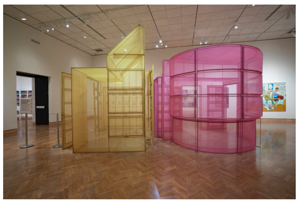
Installation views of the exhibition "When Home Won't Let You Stay: Art and Migration."