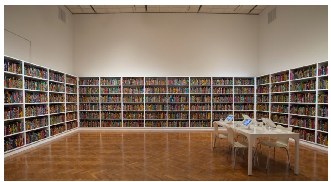
Installation views of the exhibition "When Home Won't Let You Stay: Art and Migration."