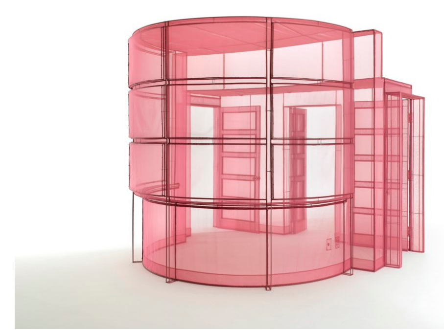
Do Ho Suh, Hub-2, Breakfast Corner, 260-7, Sungbook-Dong, Sungboo-Ku, Seoul, Korea, (2018).