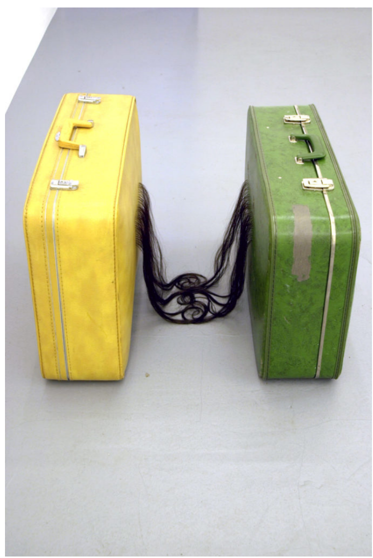
Mona Hatoum, Exodus II, 2002. Courtesy of Galerie Nordenhake. Photo: Sofia Bertilsson © Mona Hatoum.