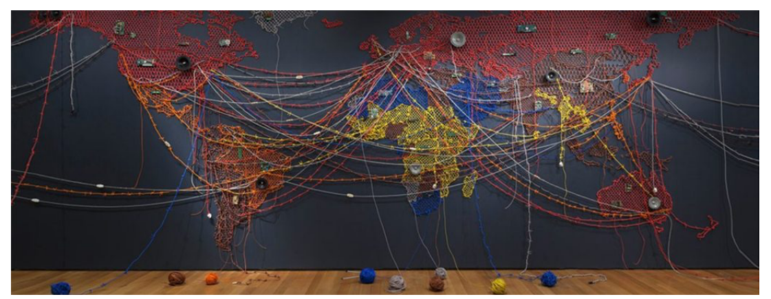
Reena Saini Kallat, Woven Chronicle (2011–16). View of installation in the Museum of Modern Art, New York, 2016–2017. Courtesy the artist. Photos by Jonathan Muzikar. Digital image © The Museum of Modern Art/Licensed by SCALA/Art Resource, NY. © Reena Saini Kallat.