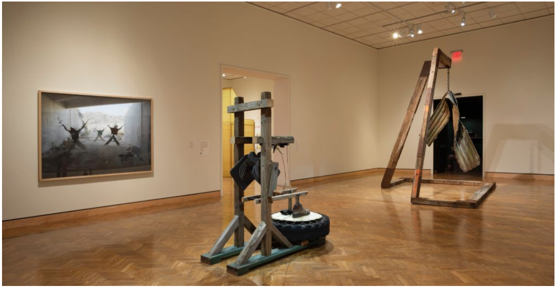
Installation views of the exhibition "When Home Won't Let You Stay: Art and Migration."