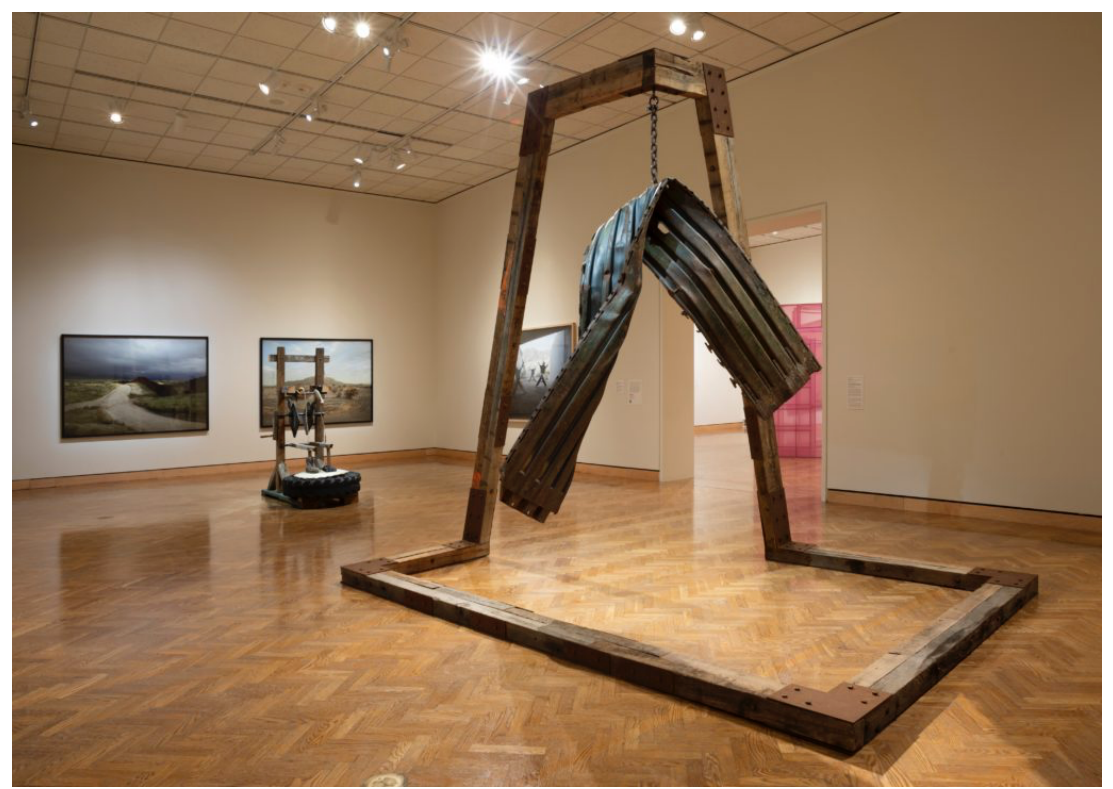
Installation views of the exhibition "When Home Won't Let You Stay: Art and Migration."