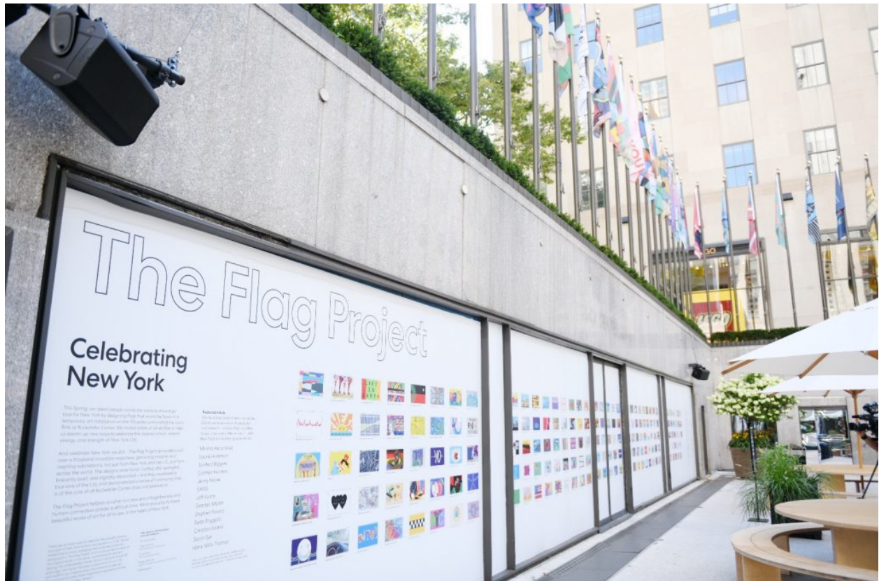
The Flag Project at Rockefeller Center.