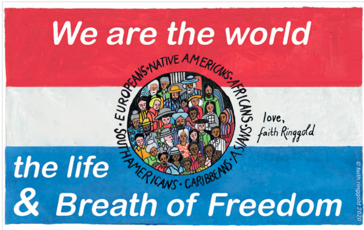
Courtesy of Faith Ringgold and the Flag Project at Rockefeller Center (2020).