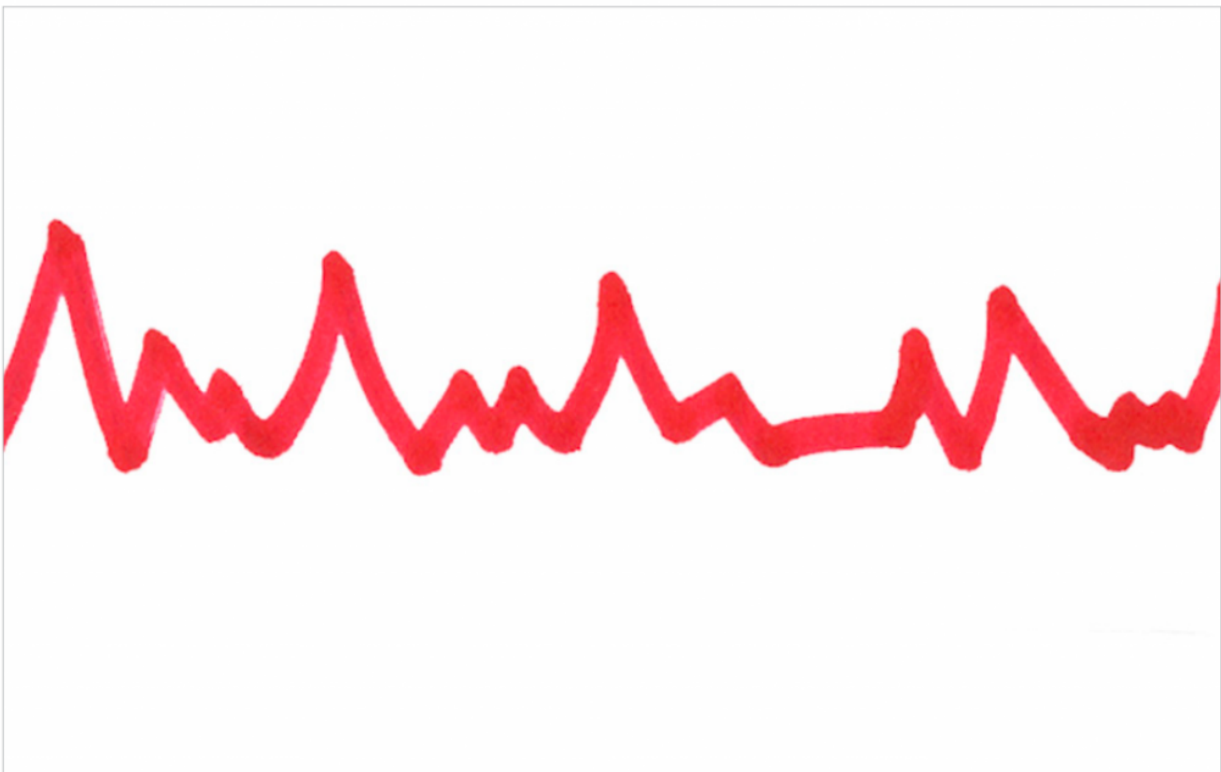
Courtesy of Marina Abramović and the Flag Project at Rockefeller Center (2020).