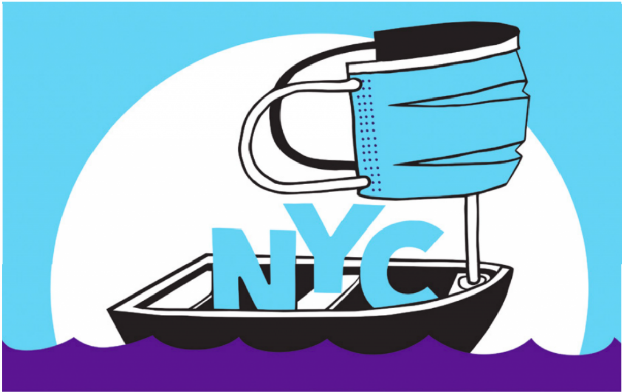
Courtesy of Steve Powers and the Flag Project at Rockefeller Center (2020).