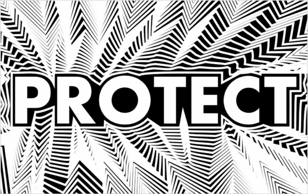
Courtesy of Jenny Holzer and the Flag Project at Rockefeller Center (2020).