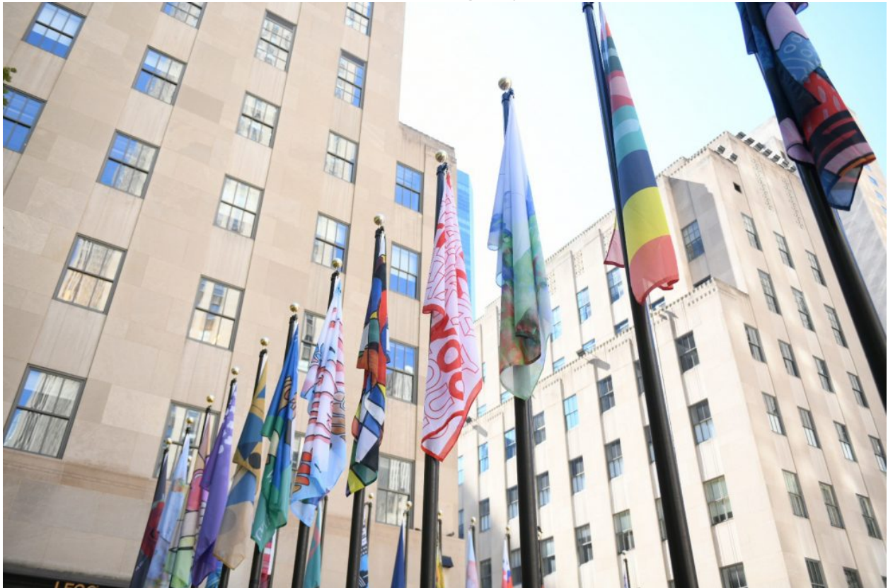
The Flag Project at Rockefeller Center. Photo courtesy of Tishman Speyer.

Courtesy of Hank Willis Thomas and the Flag Project at Rockefeller Center (2020).