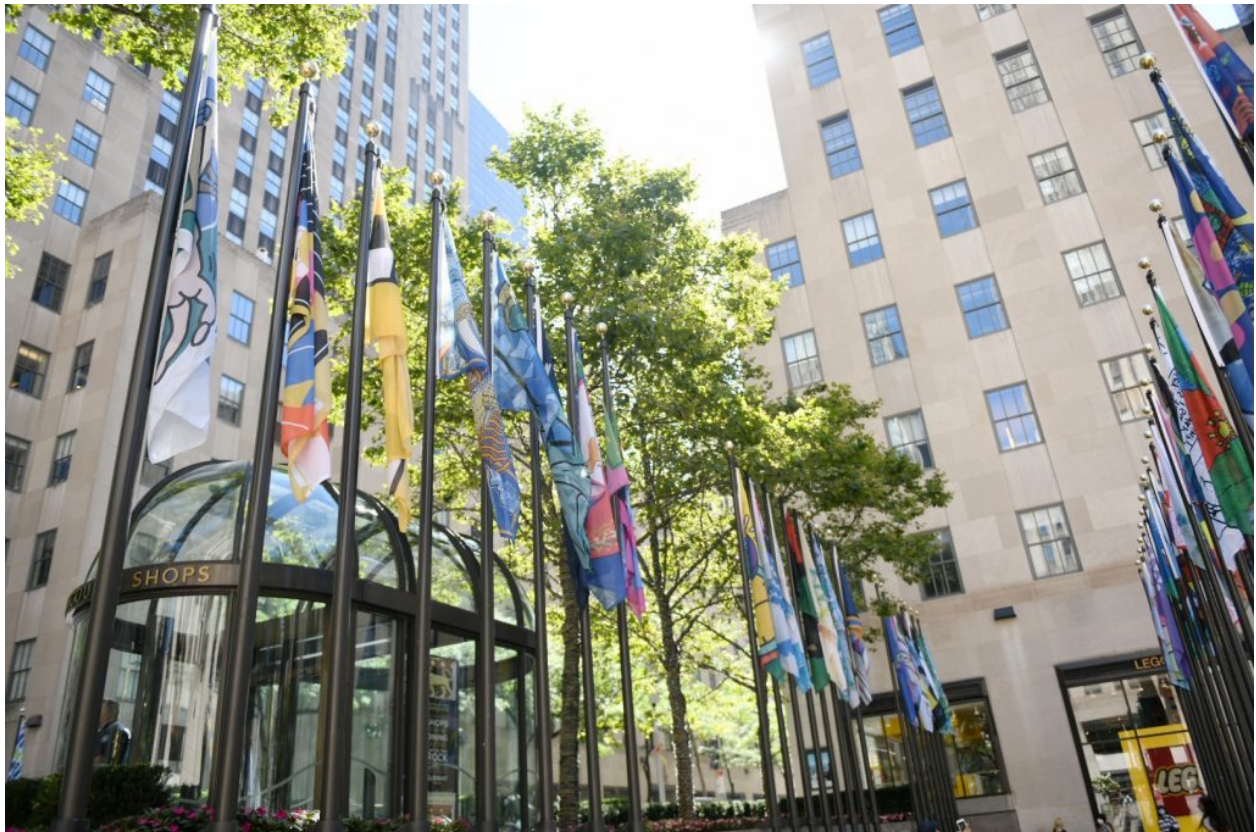
The Flag Project at Rockefeller Center.

See images of the installation and selected designs below. The Flag Project is on view at Rockefeller Plaza through August 16, 2020.