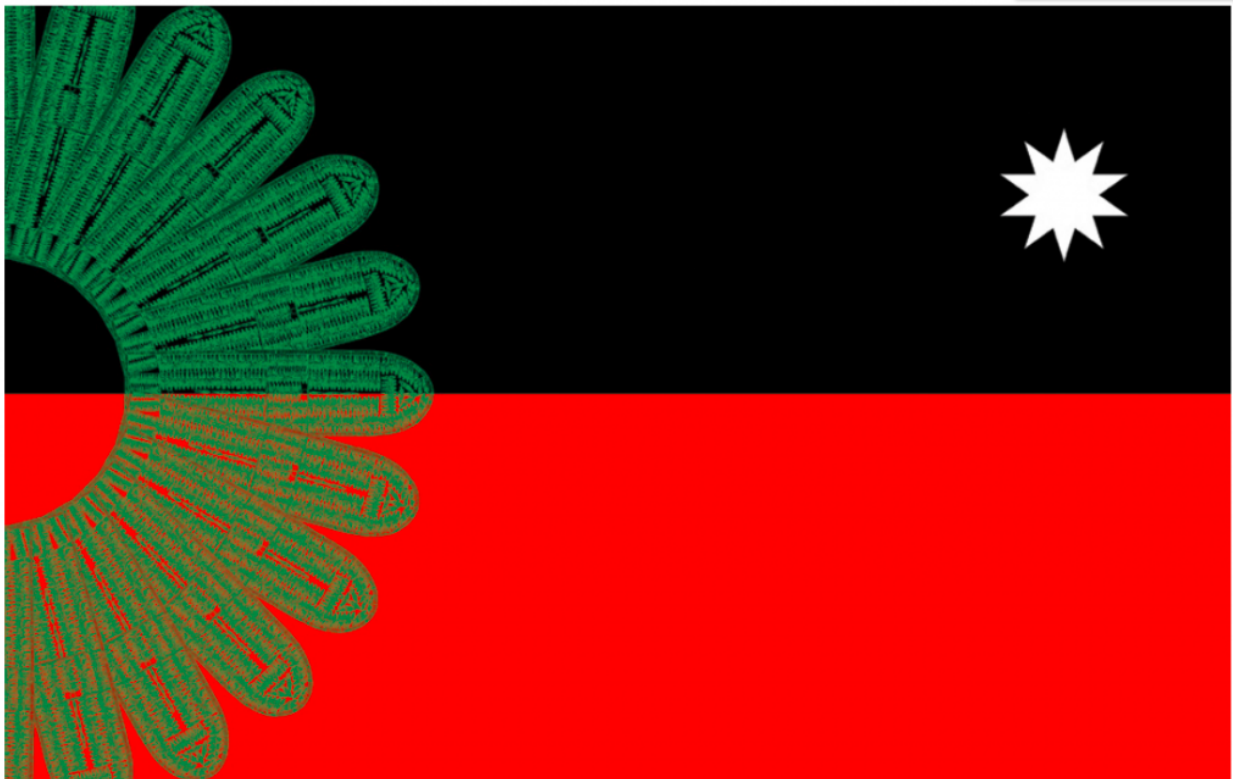
Courtesy of Sanford Biggers and the Flag Project at Rockefeller Center (2020).