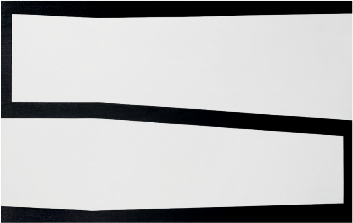
Courtesy of Carmen Herrera and the Flag Project at Rockefeller Center (2020).