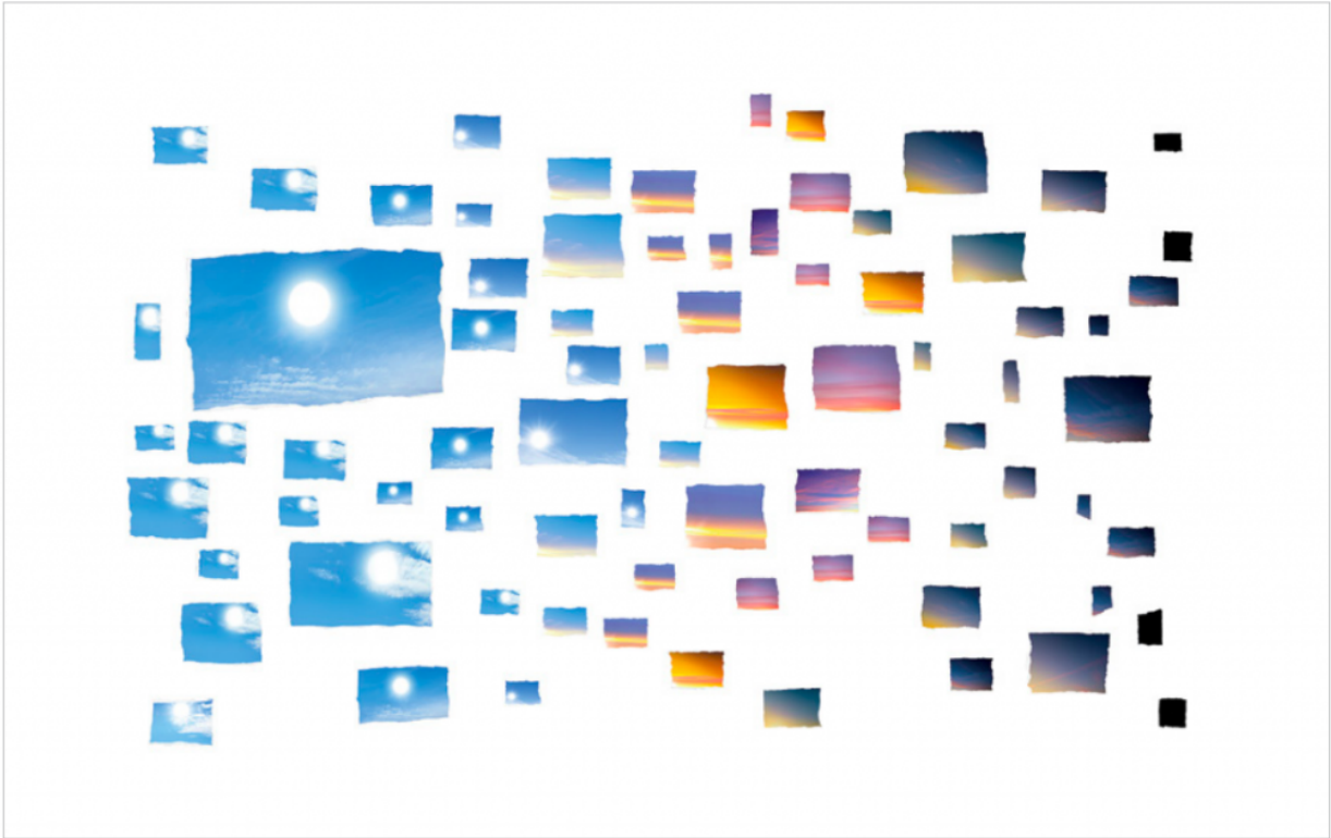
Courtesy of Sarah Sze and the Flag Project at Rockefeller Center (2020).