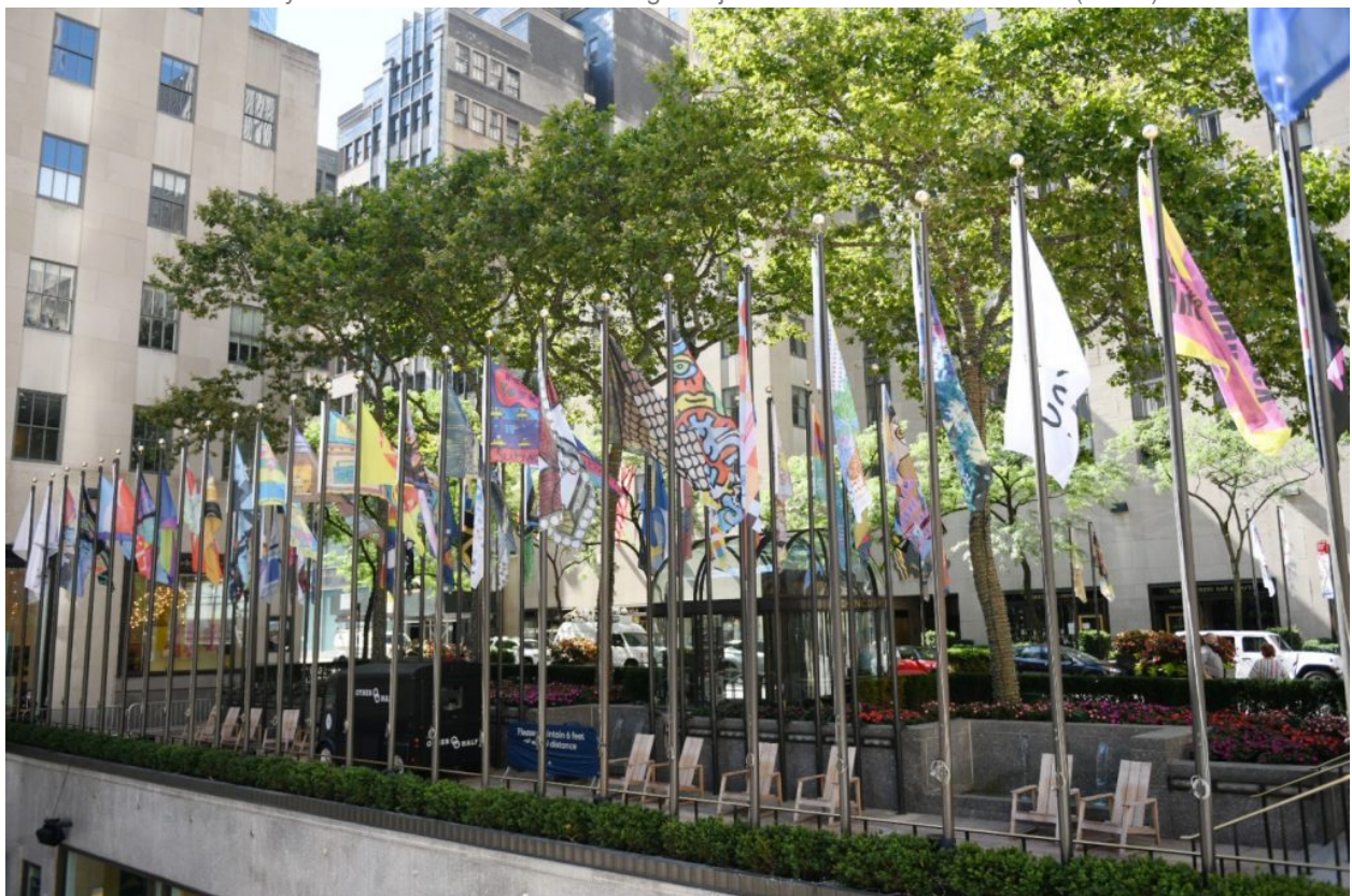
The Flag Project at Rockefeller Center.