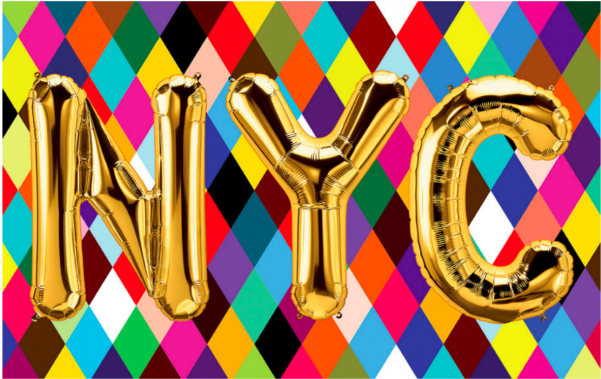
Courtesy of Jeff Koons and the Flag Project at Rockefeller Center (2020).