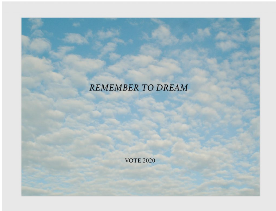
Carrie Mae Weems, Remember to Dream (2020).

Eleven Zwirner artists are partaking in the sale, including Carol Bove, Marcel Dzama, Alice Neel, and Richard Serra.