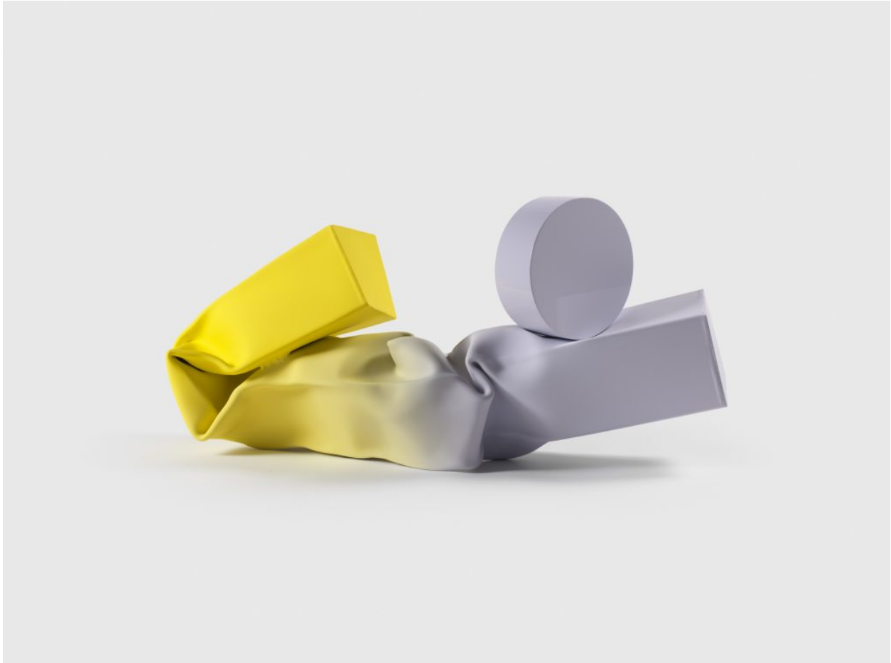
Carol Bove, Coy Satanism (2020).

The sale runs from October 2 through 8, with a preview day on October 1.