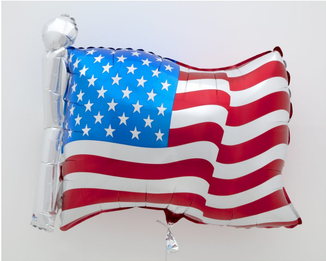
Jeff Koons, Flag (2020).

The hope is to attract a wide swath of Biden supporters, with works priced between $2,500 and $350,000, appealing to both deep-pocketed collectors, and those just starting out.