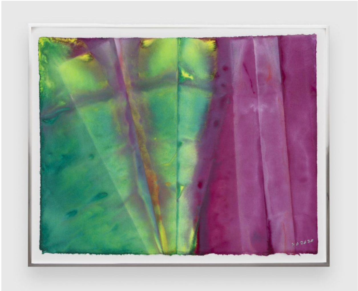
Sam Gilliam, Untitled (2020).