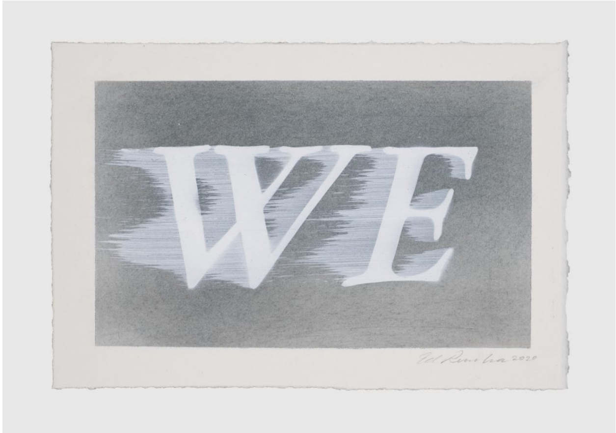
Ed Ruscha, We (#1) (2020).

“It’s the who’s who of galleries... there was no hesitation here from anybody to help out,” Zwirner said. “It’s an extremely collegial project—extremely heartwarming in this difficult year to see how everybody comes together. I’ve rarely ever seen the arts community as united as it is right now in the need and wish for a change in direction.”