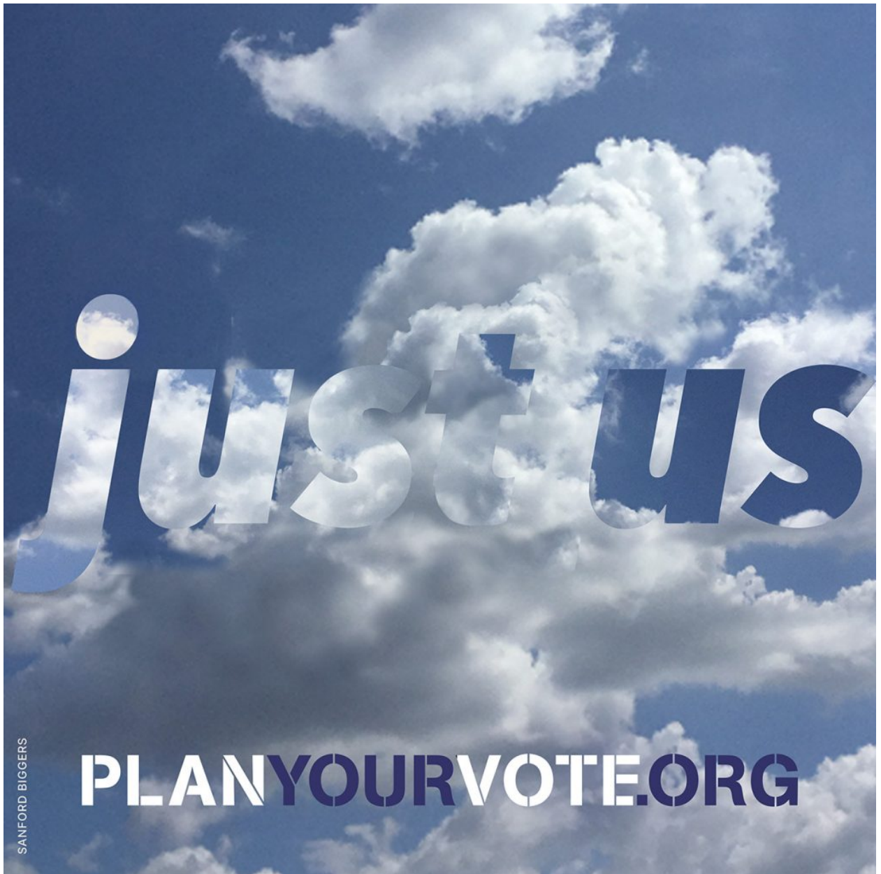
Sanford Biggers, courtesy of Plan Your Vote.