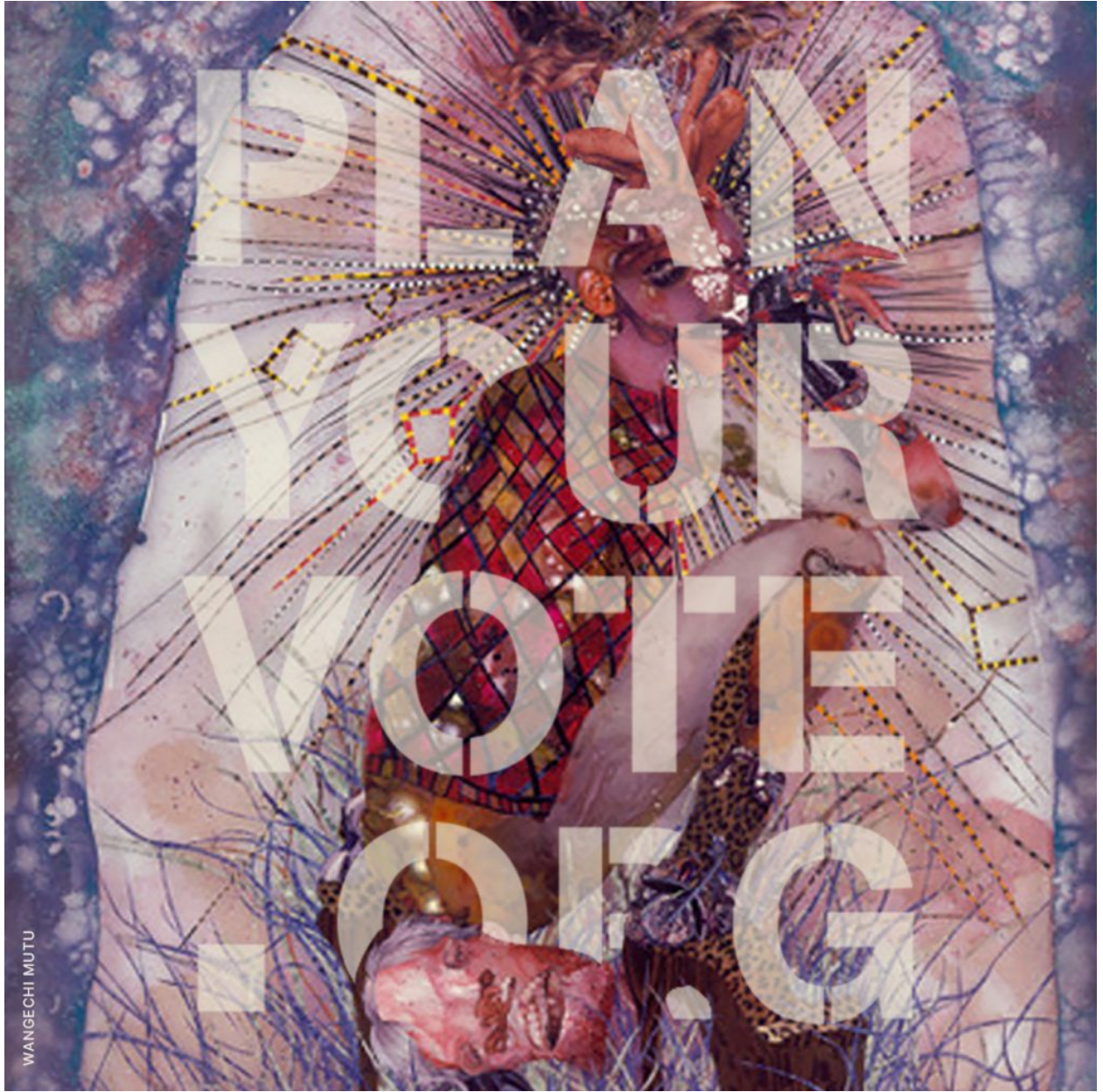
Wangechi Mutu