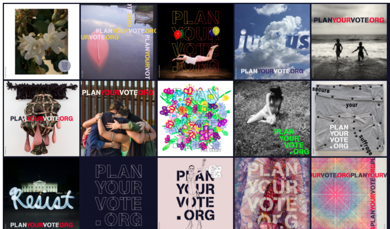
Screenshot of Plan Your Vote's art database.