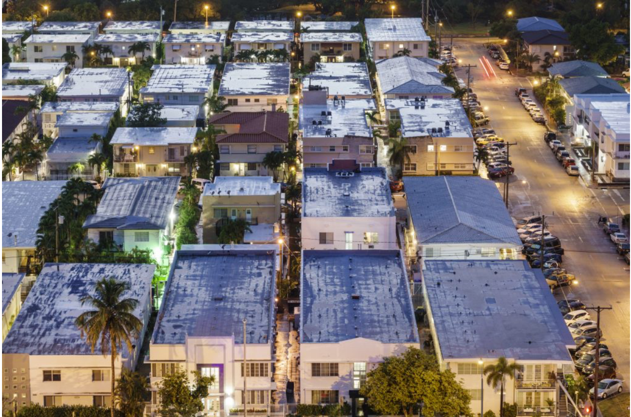
Miami Beach at dusk.

Over the past few weeks, however, a new mentality among dealers and collectors has taken hold. And that mentality is, to quote from the King James Bible : I'm going to take my talents to South Beach .