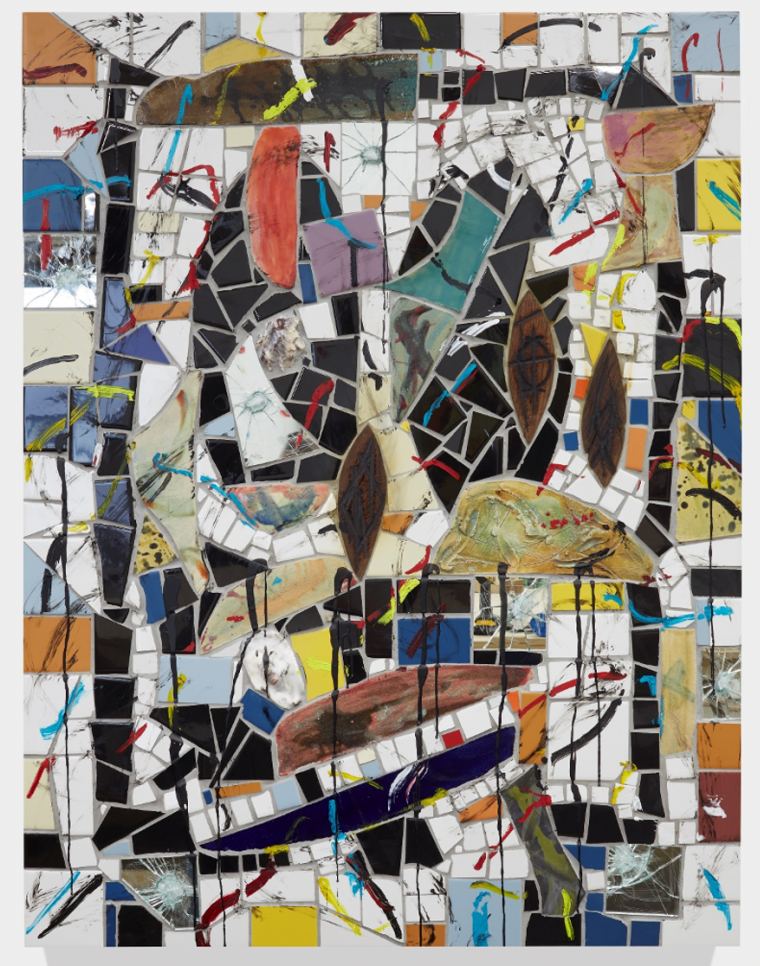
Among the first works heading to Morehouse College is Rashid Johnson's Untitled Broken Men (2020)