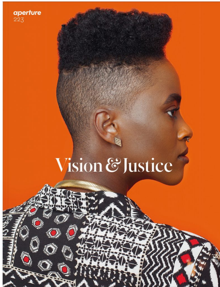
One of two covers of Aperture 223, “Vision and Justice,” featuring Awol Erizku, Untitled (Forces of Nature #1) (2014).

The groundwork project asks questions of art history itself. Is there methodological room in the discipline of art history to consider what we make of these artistic practices focused on bodies denied this upright position of self-sovereignty and agency? Beyond providing a new framework of analysis via groundwork, engaging with the meaning of the term “ground”—as both reason, fact, but also soil itself—to address the injustices wrought at our feet, I see this work as laying out questions for the discipline of art history and related fields to engage more decisively with the sociopolitical life that informs artistic production in the context of racial contestation.