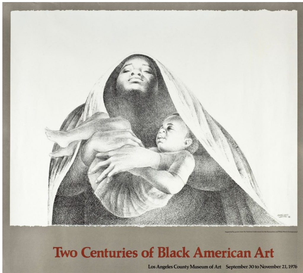
Poster for David Driskall's "Two Century of Black American Art" at LACMA, featuring Charles White, I Have a Dream (1976).

What is interesting about our current moment, however, is that we are seeing, I would argue, power shift not so much away from museums, but becoming shared with the work of scholarship to properly position Black artists within the grand narrative of history. When you study the work of even the most celebrated Black artists—as I noted when finishing the MIT Press October File on Carrie Mae Weems—you often find that their work has been over-exhibited and under-theorized, and this has created an asymmetry between acclaim and the discourse on their work. This has all sorts of consequences for market value, yes, but for me, most importantly, their place within history.