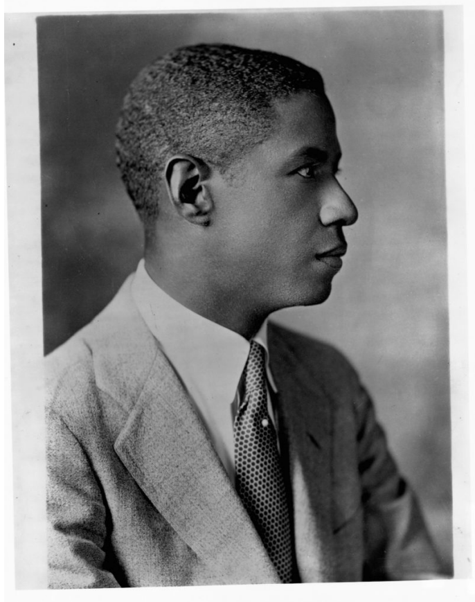
Art historian James A. Porter.

Your first museum job was at the Museum of Modern Art and you've worked at the Tate in London. Can you briefly describe these experiences, and some of the biggest observations you made about the institutions with regards to their approach to the stewardship and/or lack thereof of African American art and history?