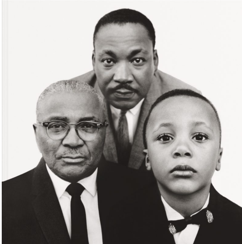
One of two covers of Aperture 223, "Vision and Justice," featuring Richard Avedon, Martin Luther King, Jr. , civil rights leader, with his father, Martin Luther King, Baptist minister , and his son, Martin Luther King III, Atlanta, Georgia (1963).

How are artists, and how is the discipline of art history, responding to the hyper-visibility of racial injustices on American ground? We see that a number of artists including Mark Bradford, Theaster Gates, Amy Sherald, Xaviera Simmons, Hank Willis Thomas, and Kehinde Wiley, and new landmarks such as the Equal Justice Initiative's National Memorial for Peace and Justice, have initiated a set of what I consider to be "groundwork" aesthetics in the Stand Your Ground Era (see Art Journal , Winter 2020 issue).