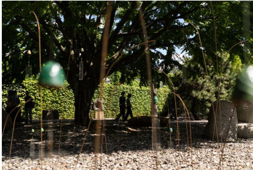
“Christian Boltanski: Animitas” in the garden of Noguchi Museum, an oasis in Long Island City, Queens.

Through Sept. 5. Noguchi Museum, 9-01 33rd Road, Long Island City; 718-204-7088; noguchi.org .