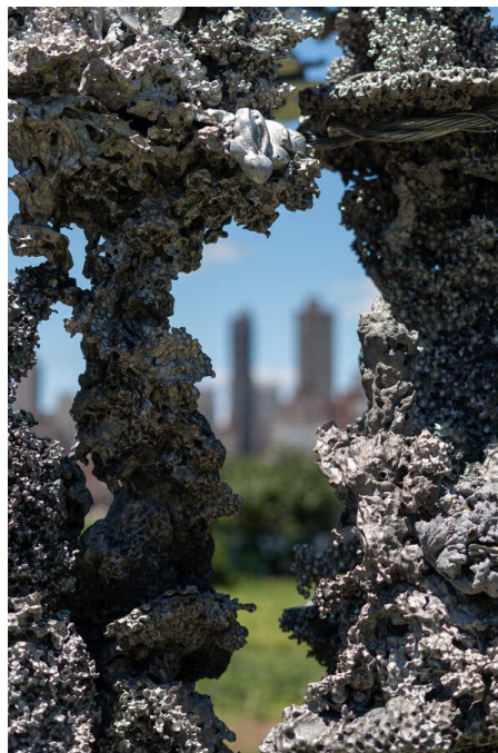
Detail from "Disease Throwers."