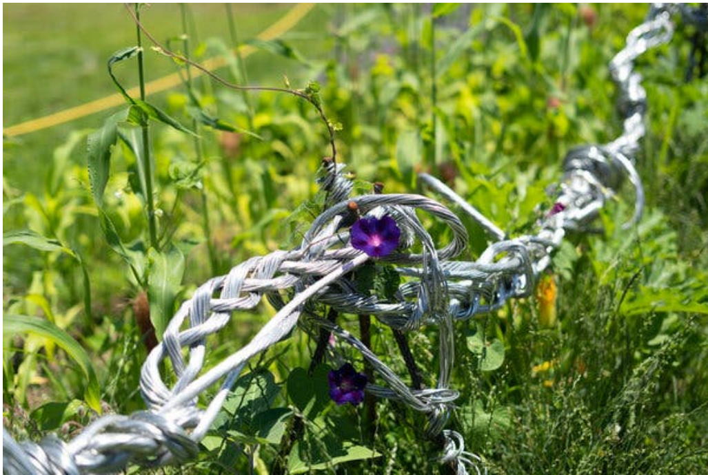
Medicinal plants and braided wire from “Planeta Abuelx” at Socrates Sculpture Park.

Trauma and healing are central to Guadalupe Maravilla’s work, and his “Planeta Abuelx” at Socrates Sculpture Park takes both a pragmatic and symbolic approach to addressing these themes. “Planeta Abuelx” expands the idea of Mother Earth to a more intergenerational “Grandparents Planet.” The central object here is “Disease Throwers (#13, #14)” from 2021, a towering, twisting sculpture made of cast aluminum and steel tubing with gongs that serve as a kind of head and belly to the pyramid-shaped work. The work is ringed by a temporary garden of medicinal plants, along with squash, beans and corn — vegetables central to the indigenous diet of the Americas — as well as tobacco and roses. Performances in the form of sound baths turn “Disease Throwers” into an actual (hopefully) therapeutic exercise, rather than a merely symbolic one. For Maravilla, this is all personal: He migrated to this country as an unaccompanied minor during the Salvadoran war of the 1980s and later survived colon cancer. Connecting artists, viewers and the landscape, “Planeta Abuelx” is also easily accessible by NYC Ferry on the East River (a few minutes from the Astoria stop), which costs the same as a ride on the subway. The project is one of the best Socrates has presented in recent years.