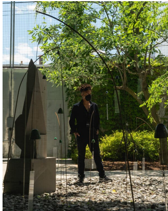
The bells are interspersed with Noguchi stone sculptures.