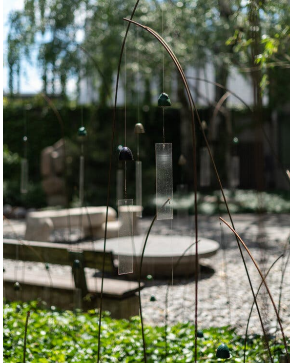
Bronze bells with dancing strips of plexiglass twist and turn in the wind, giving the installation movement.

Just across the street from Socrates, the Paris-born conceptual artist Christian Boltanski has filled the garden of the Noguchi Museum — one of the most beautiful enclosed outdoor spaces in New York — with 180 small bronze bells in his installation “Animitas.” The title refers to the altars that Indigenous natives of Chile put on the side of the roads to honor the dead.