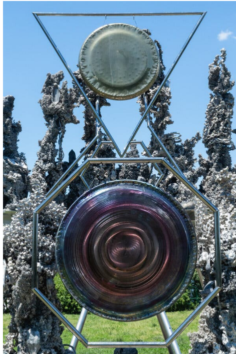
Artist-as healer, Guadalupe Maravilla's "Disease Throwers" from "Planeta Abuelx."

Socrates Sculpture Park, 32-01 Vernon Boulevard, Long Island City, Queens; 718-956-1819; socratessculpturepark.org .