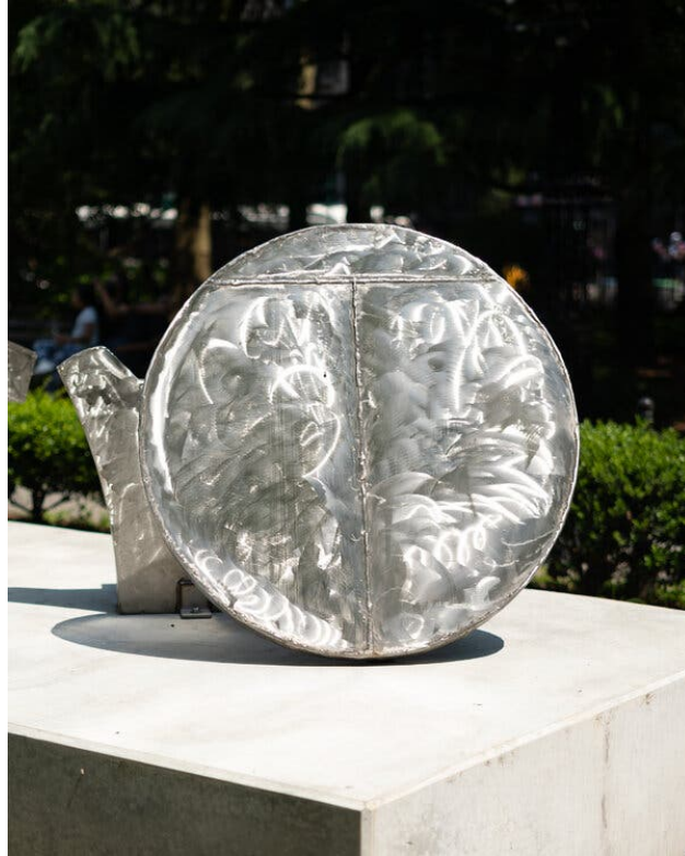
Edwards's "Ukpo. Edo," 1992/1996 at City Hall Park.

Melvin Edwards came to prominence as a sculptor with his tough, abstract "Lynch Fragments," begun in 1963. Made with welded-together scraps of metal, the series drew from both African sculpture and European and American modernism, perfectly conveying the awful, violent, twisted nature of its subject matter. "Brighter Days" located in City Hall Park in Lower Manhattan, which is also the site of the 18th-century African Burial Ground, a cemetery where both free and enslaved people were buried, serves as a small survey of Edwards's larger works. The sculptures in "Brighter Days" are less visceral and more monumental than the "Lynch Fragments," resembling the abstract, burnished steel sculptures of David Smith. Some, like "Song of the Broken Chains" (2020), elegantly memorialize the enslaved ancestors. Others, like "Ukpo. Edo" from the '90s refer directly to African precedents. (Ukpo is a dish made in Nigeria with plantains.) Last summer, a few yards from these sculptures, Black Lives Matter activists took over a section of this area, reminding you that the history and struggle Edwards refers to in his sculptures is hardly over.