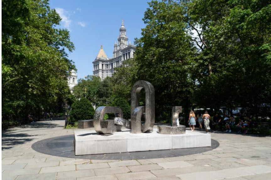
"Song of the Broken Chains" (2020) from "Melvin Edwards: Brighter Days" at City Hall Park.

Through Nov. 28. City Hall Park, Manhattan; publicartfund.org .