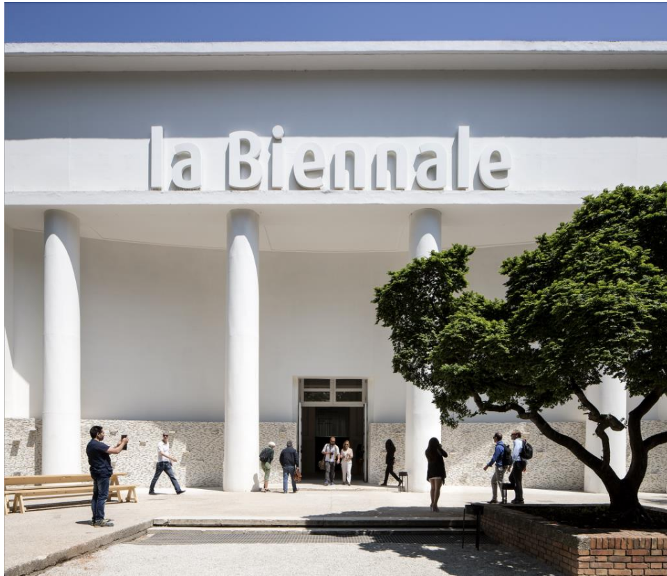
Padiglione Centrale Giardini.