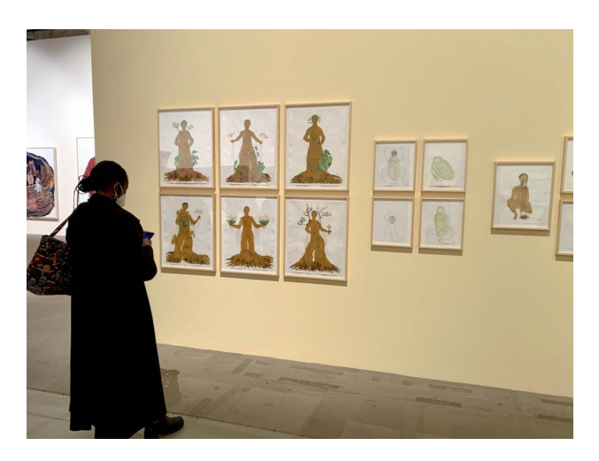
Works by Rosana Paulino.