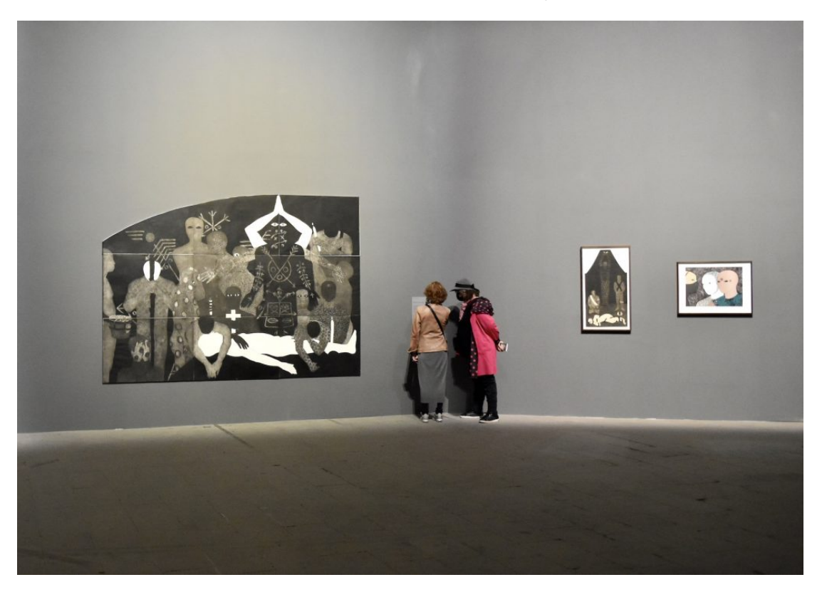
Works by Belkis Ayón in "The Milk of Dreams."