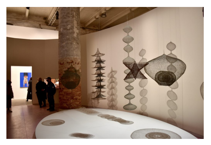
Display of works by Ruth Asawa.