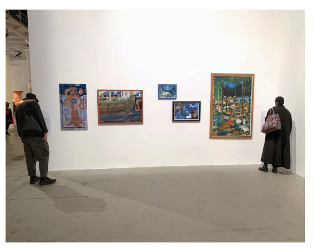
Works by Violeta Parra.