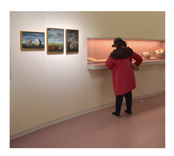
A special capsule presentation titled "A Leaf a Gourd a Shell a Net a Bag a Sling a Sack a Bottle a Pot a Box a Container."