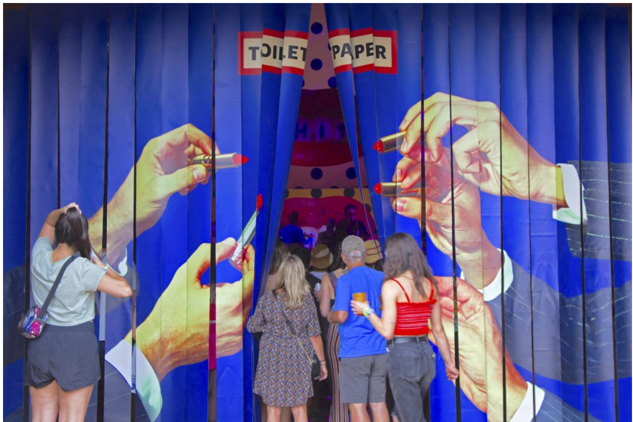
Entrance to TOILETPAPER MAGAZINE's Drag Me to the Disco (2022).