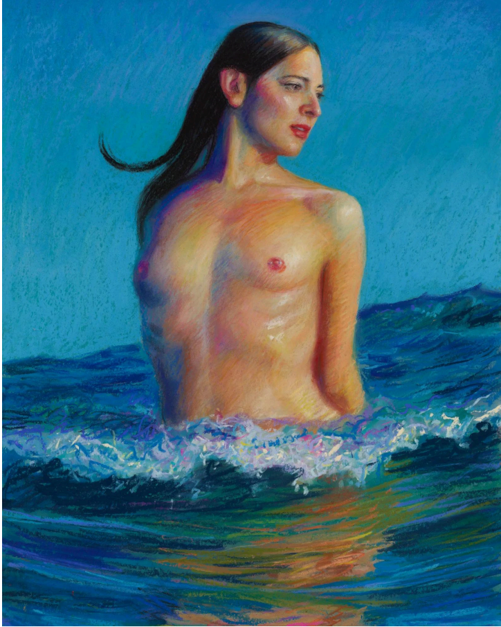
© TM Davy TM Davy, Hari Sea , 2021.