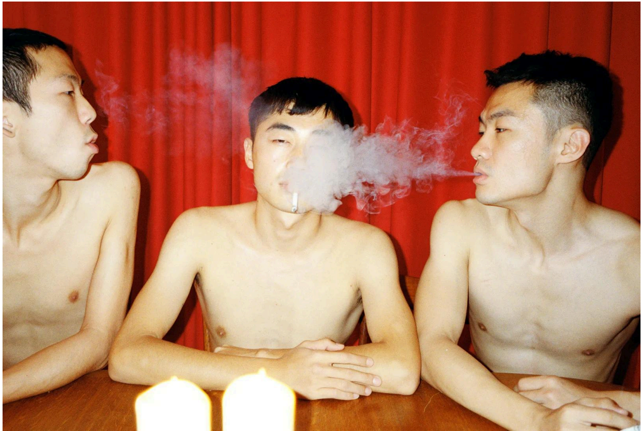
© Lin Zhipeng (aka No.223) LinZhipeng (aka No.223), Smoking 3some , 2018.