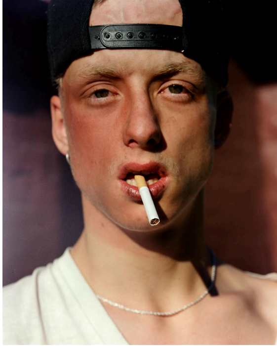
© Eve Fowler Eve Fowler, Untitled from the series 'Hustlers' , 1996.