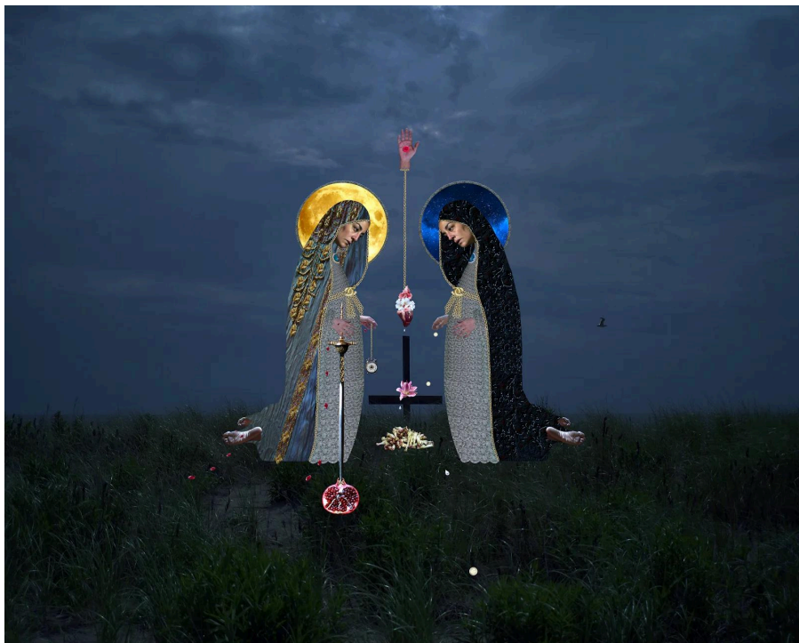
© Ghada Khunji Ghada Khunji, Maria, Myself and I from the series 'The Dark Ages,' 2016.