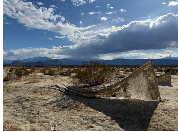
Muhannad Shono's "What Remains" is seen on display for Desert X 2025 on Avenue 38 off Varner Road in Thousand Palms, on March 7, 2025.

When there is no place left that you can call home, that you can return to and settle upon, what remains? Muhannad Shono's "What Remains" imagines what would be left behind in a sandy plot after a big windstorm. Long strips of fabric covered in sand are positioned throughout a field, appearing as if they've been mangled in bushes and are swaying in the wind. It's a staggering visual both on the ground and from a higher elevation, which uses the land to its advantage as it takes on the shape of nature.