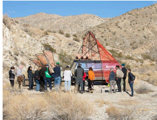
Desert X installation "G.H.O.S.T. Ride" in Desert Hot Springs, Calif., on March 7, 2025.