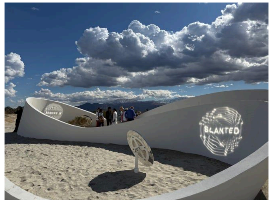
Sarah Meyohas' "Truth Arrives in Slanted Beams" is seen on display as part of Desert X 2025 at 74-184 Portola Road in Palm Desert, on March 7, 2025.

Sarah Meyohas' sprawling "Truth Arrives in Slanted Beams" showcases "caustics," or light patterns formed by the refraction or reflection of light through curved surfaces. Visitors are greeted by a white pathway on the side of the road that leads them to the ribbon-like installation. As you go to each stop, words from the art piece's name are projected onto the white walls, which visitors can manipulate. Waves and other patterns (we promise they're not mirages) are seen projected as well.