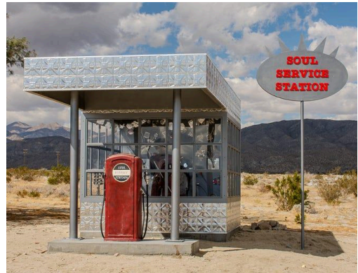
Desert X installation "Soul Service Station" in Desert Hot Springs, Calif., on March 7, 2025. Brian Blueskye

A mysterious gas station, located off Pierson Boulevard in Desert Hot Springs, features several signs welcoming customers to the full-service experience that was once common at gas stations. Its small and rustic design blends seamlessly with the surrounding landscape. However, if you look closely, you'll notice a peculiar figure standing behind the glass inside. If you pick up one of the conch shells attached to the single gas pump, you'll hear her recite a poem.