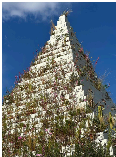
The Living Pyramid by Agnes Denes, DesertX 2025