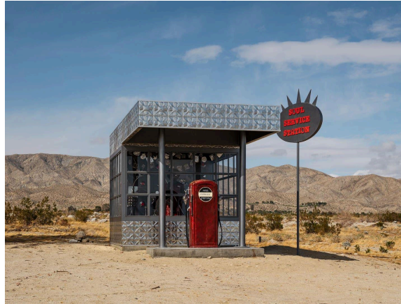
Installation view Alison Saar, Soul Service Station , DesertX 2025

This year's DesertX may be the best yet. On opening weekend when I visited not all the artworks were open to the public yet (they probably all are by now).