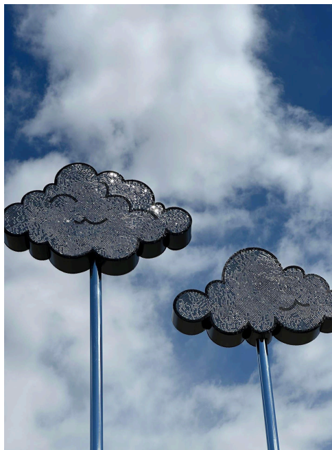
Installation view Sanford Biggers, DesertX 2025

Part of the experience, and the fun of Desert X , is driving around searching for the artworks. Waze and the DesertX app led me on drives through parts of the valley I'd never seen, including high mountain roads, and old downtowns in Desert Hot Springs and corners and canyons I'd never been to before.